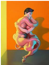
Yanmeng Zhang 章烟朦

No. 5, Lane 386, Changle Road, Huangpu District, Shanghai