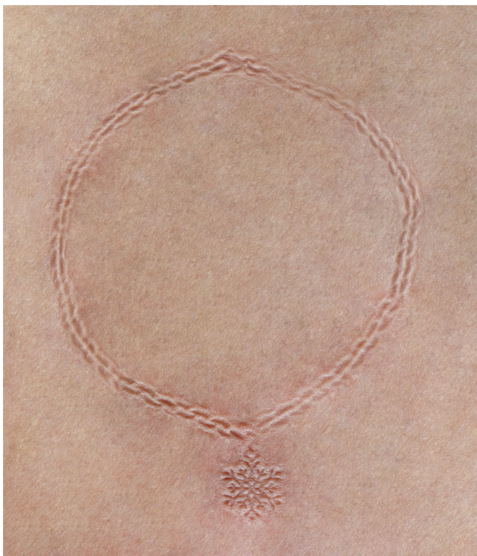
出逃的冬日 (组) / The winter of escape (Group) | 2024 综合材料: PVC 链条、硅胶、收藏级爱普生微喷 / Mixed materials: PVC chain, silicone, collectible Epson micro spray 600 x 4.5cm 、 150 x 130cm