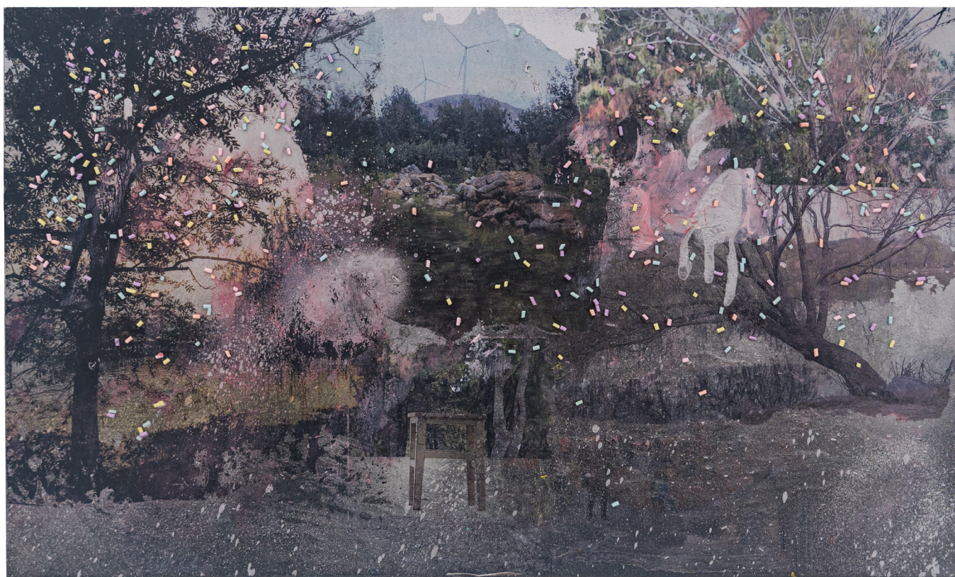
飞光飞光 1 / Flying light 1 | 2024 综合材料：铁板、丙烯、PVC、印刷图像 / Mixed materials: Iron plate, acrylic, PVC, printed image 50 x 30cm