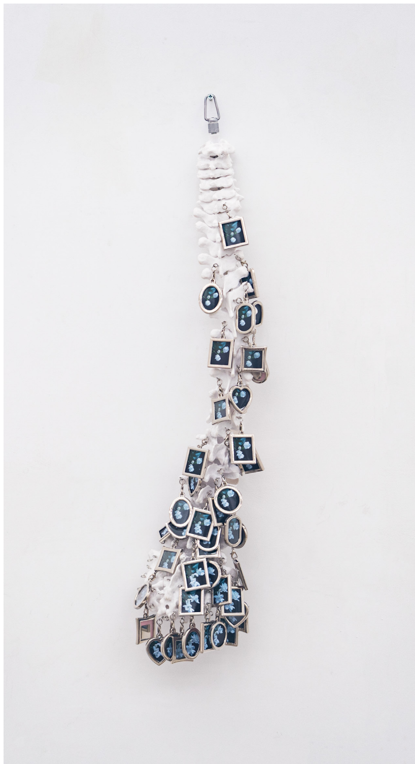
如影随形：茉莉开在脊椎 / Follow me like a shadow: Jasmine blooms on the spine | 2024 综合材料：树脂骨骼模型、印刷照片 / Mixed materials: Resin bone model, printed photo 70 x 20 x 5cm