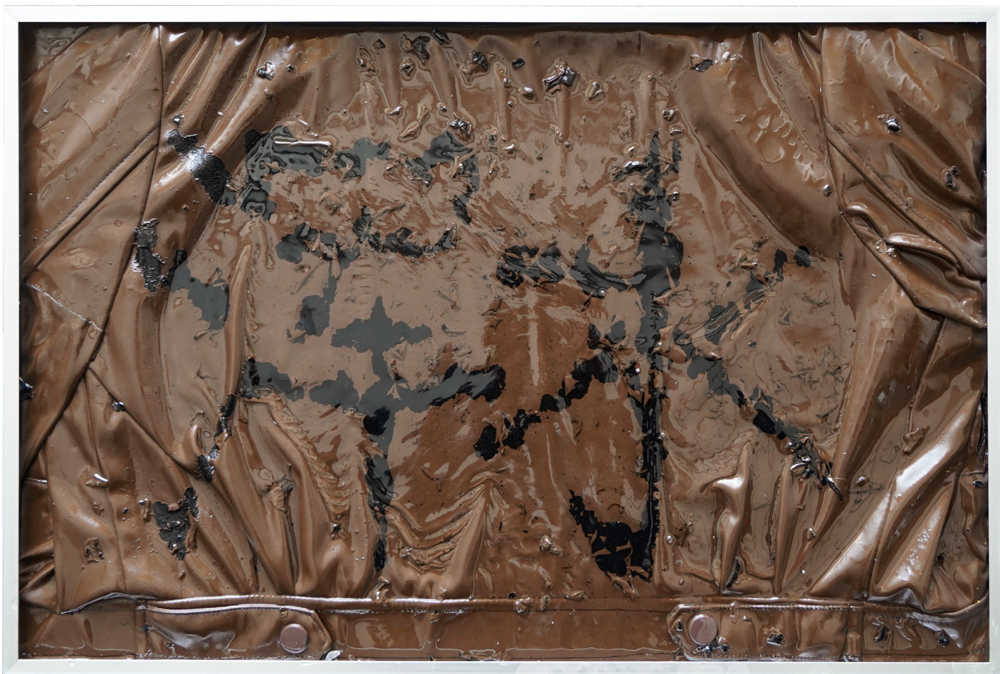
青春期：浑水 / Puberty: Muddy water | 2024 综合材料：人造革皮衣、环氧树脂、铝合金框 / Mixed materials: Artificial leather jacket, epoxy resin, aluminium alloy frame 40 x 60 x 7cm