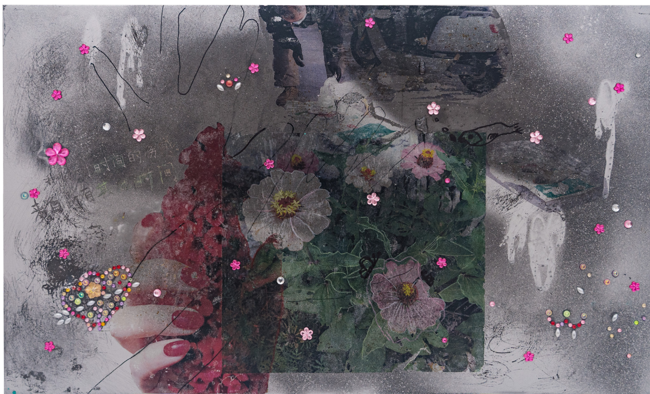
飞光飞光 2 / Flying light 2 | 2024