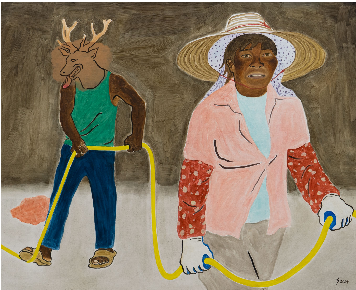
狗头鹿 / A deer with a dog's head | 2024 布面油画 / Oil on canvas 150 x 120cm