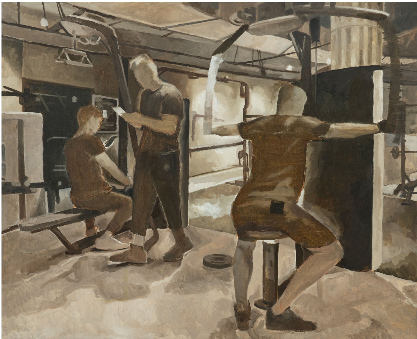
隔阂VI / Estrangement VI | 2020 布面油画 / Oil on canvas 170 x 135cm