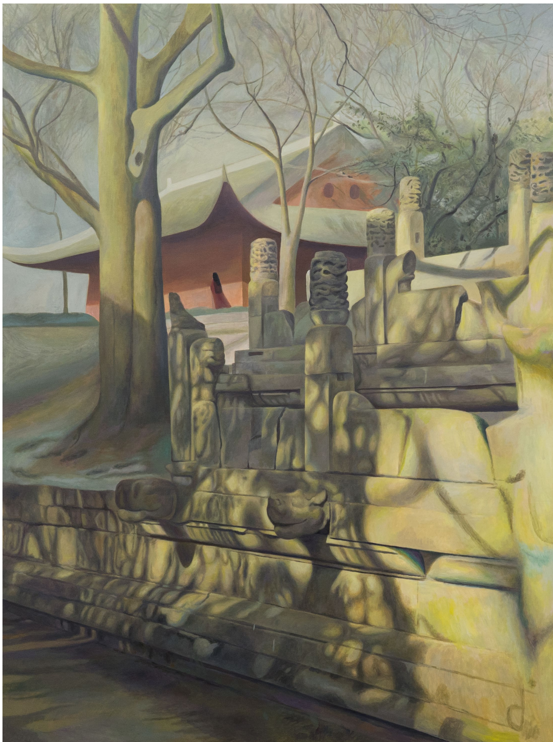
褪色的世界 / Faded world | 2023 布面丙烯 / Acrylic on canvas 150 x 200cm