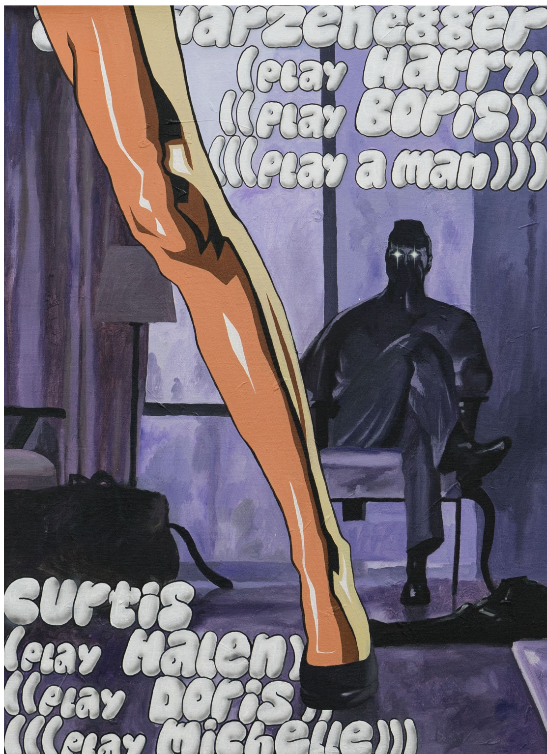
扮演 / Play | 2024 布面丙烯 / Acrylic on canvas 100 x 80cm