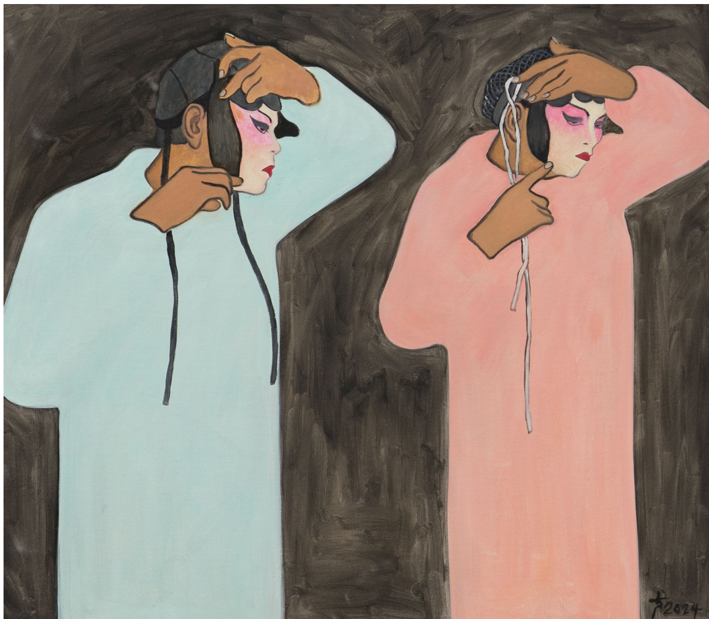
粤剧演员 / Cantonese opera actor | 2024 布面油画 / Oil on canvas 80 x 70cm