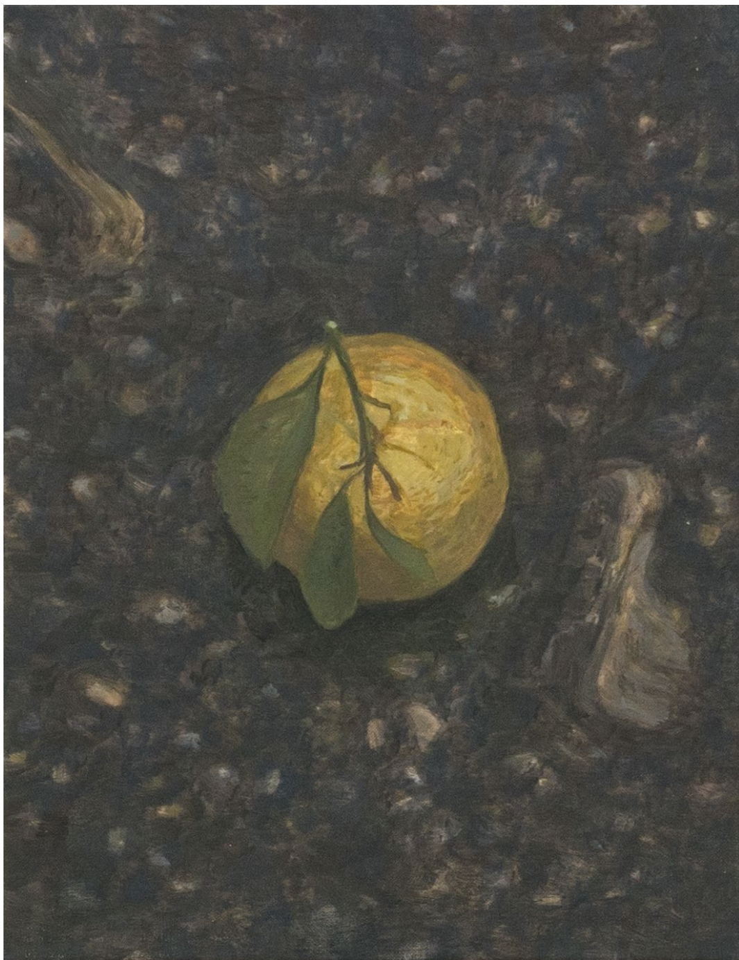
湿土 / Wet Dirt | 2024 布面油画 / Oil on canvas 35 x 27cm