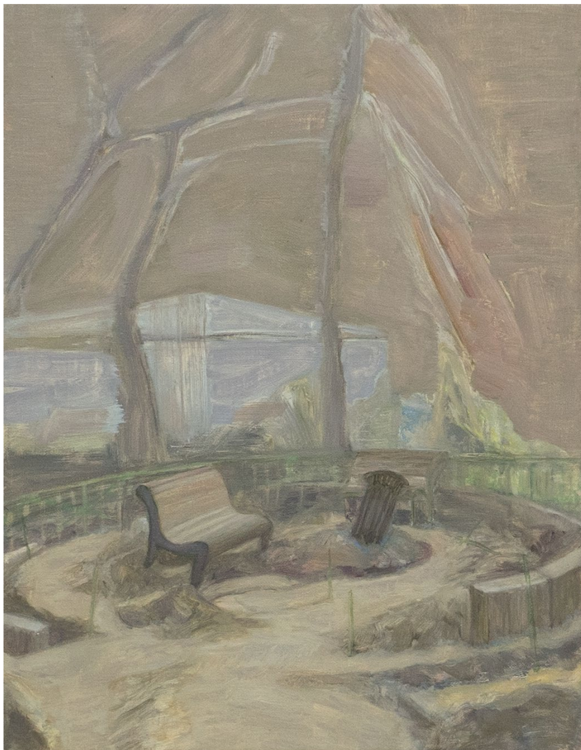
春脾气 / Spring Temper | 2024 布面油画 / Oil on canvas 35 x 27cm