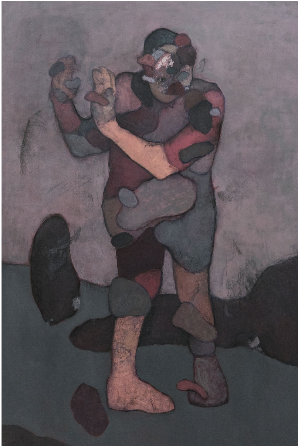
蹩脚演员 NO.7 / lame performer NO.7 | 2023 布面油画 / Oil on canvas 150 x 100cm