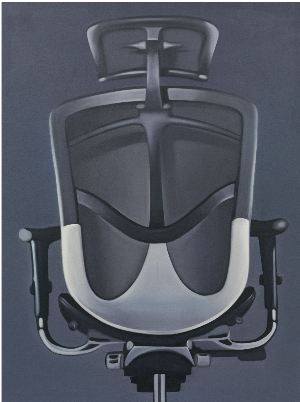
人体肖像 011 / Body portrait 011 | 2024 布面油画 / Oil on canvas 120 x 90cm