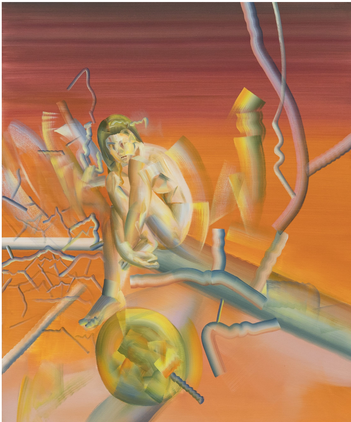
最后的夜晚 / The last night | 2024 布面油画 / Oil on canvas 100 x 120cm