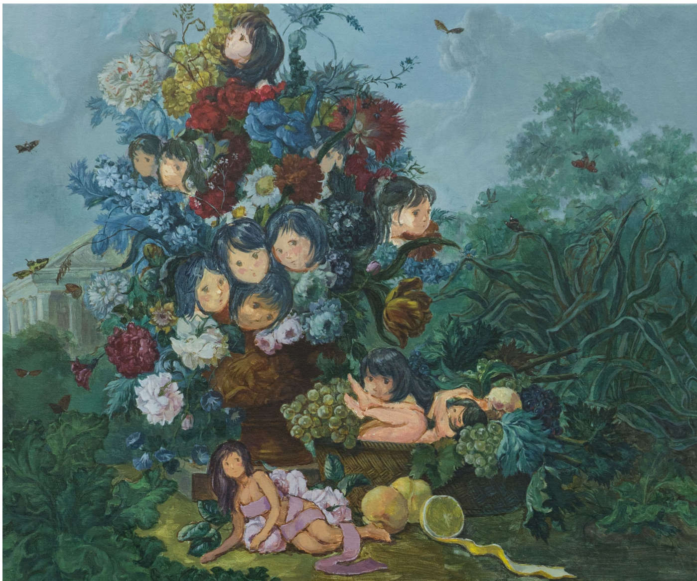
虚空静物 / Void still life | 2024 布面丙烯 / Acrylic on canvas 89 x 74cm