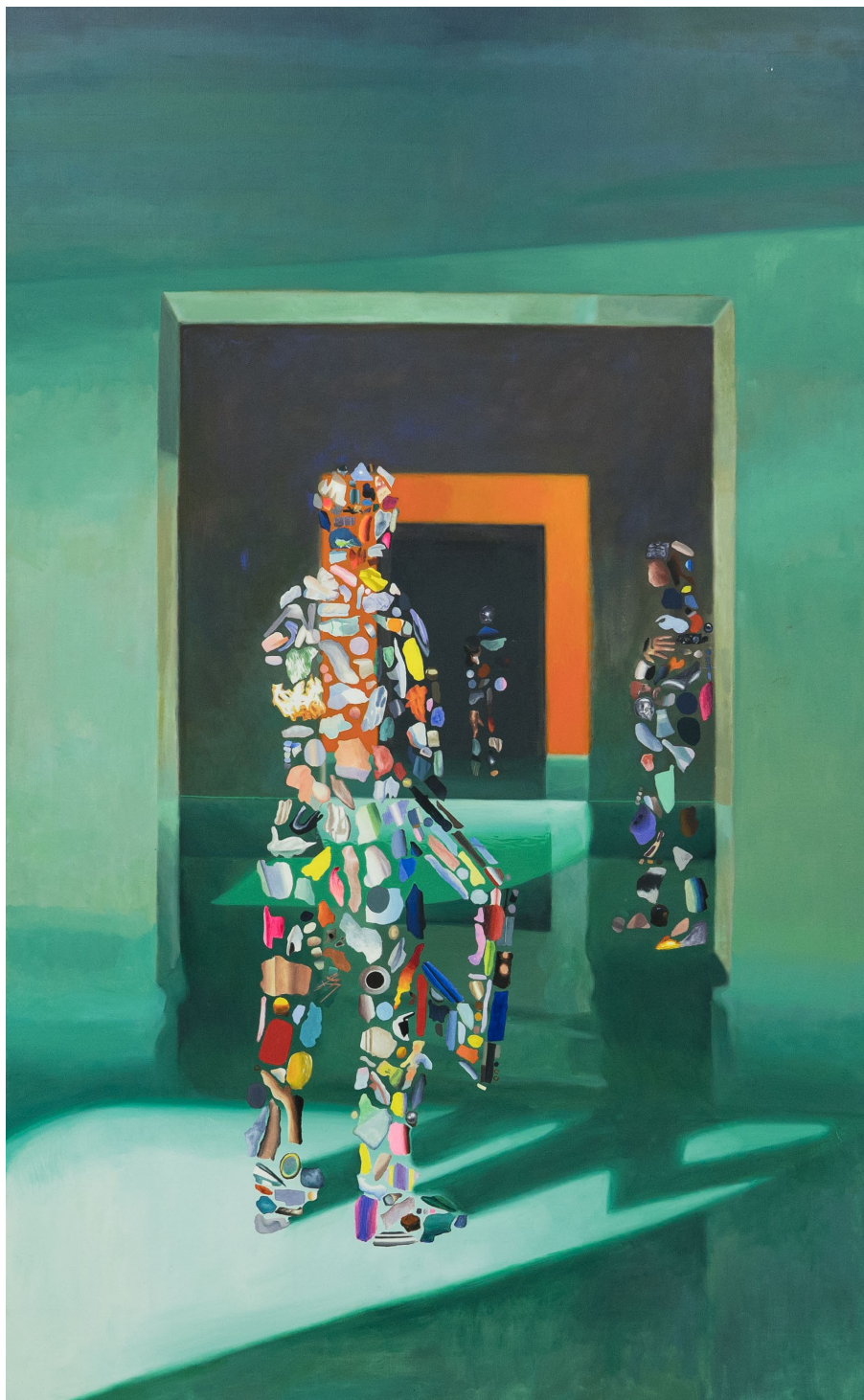
走向陌生 2 / Go strange 2 | 2023 布面油画 / Oil on canvas 200 x 120cm