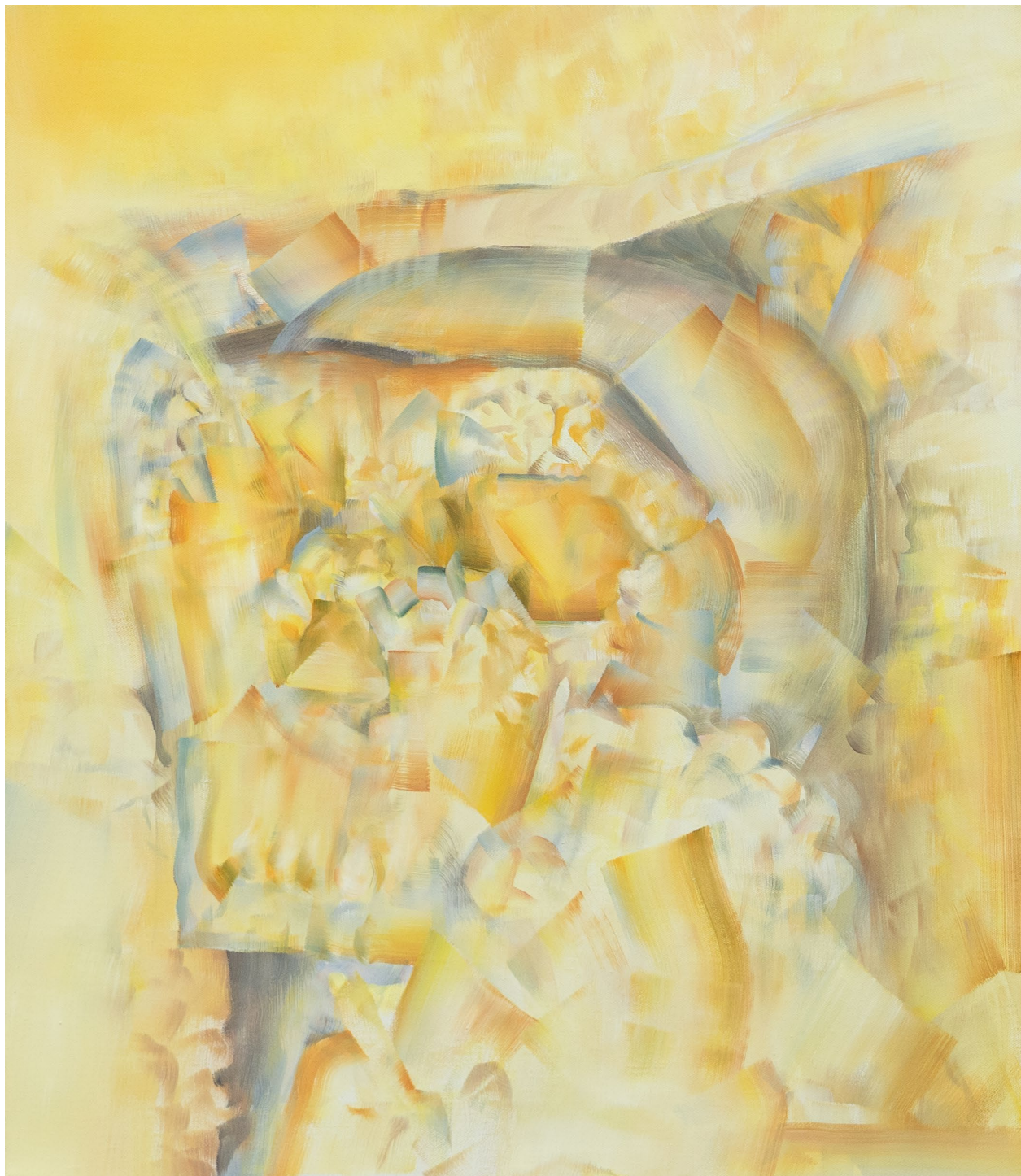
尼安德特 / Homo neanderthalensis | 2023-2024 布面油画 / Oil on canvas 78 x 90cm