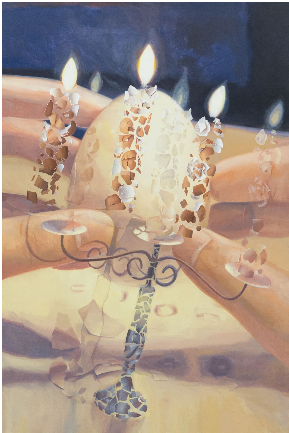
蛋壳 / eggshell | 2024 布面油画 / Oil on canvas 120 x 80cm