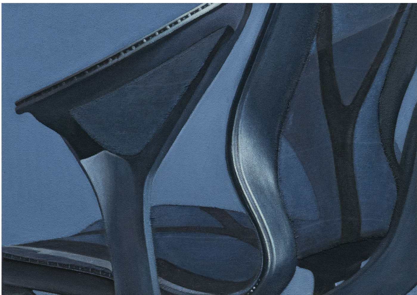
人体肖像 005 / Body portrait 005 | 2024 布面油画 / Oil on canvas 60 x 80cm