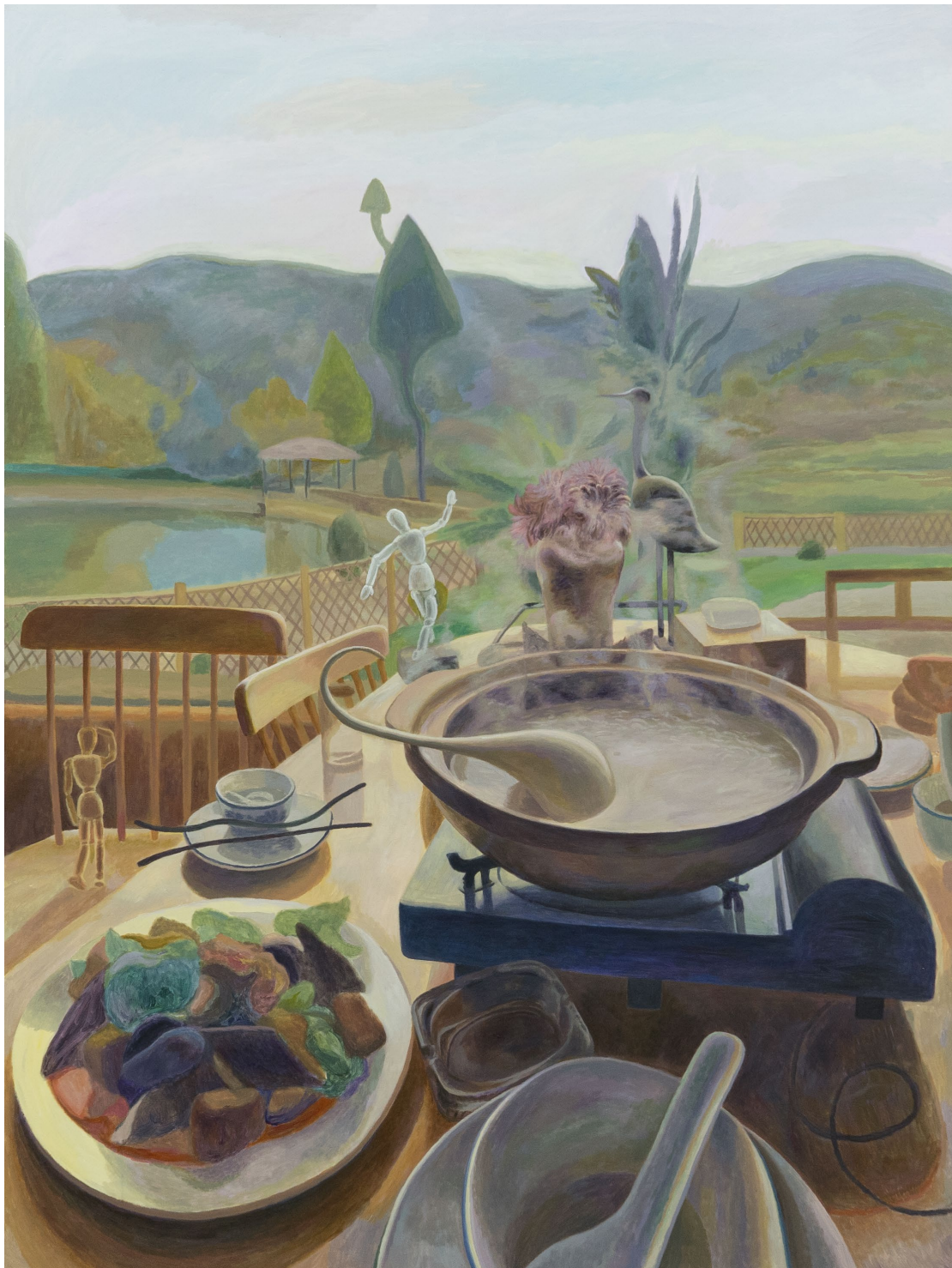
吃了咸菜滚豆腐，皇帝老子不及吾 / Ate boiled tofu with pickles, the emperor is not as good as me | 2023 布面丙烯 / Acrylic on canvas 200 x 150cm