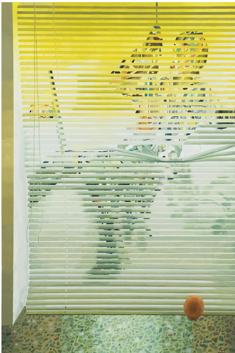
没有什么被擦除 / Nothing was erased | 2024 布面油画 / Oil on canvas 150 x 100cm