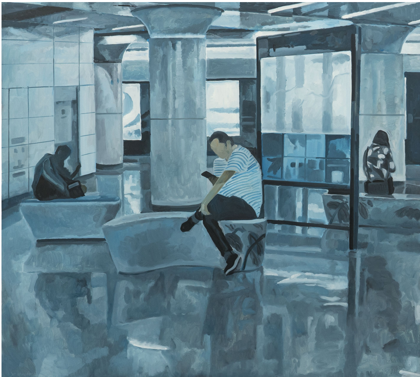
隔阂 V / Estrangement V | 2020 布面油画 / Oil on canvas 135 x 150cm