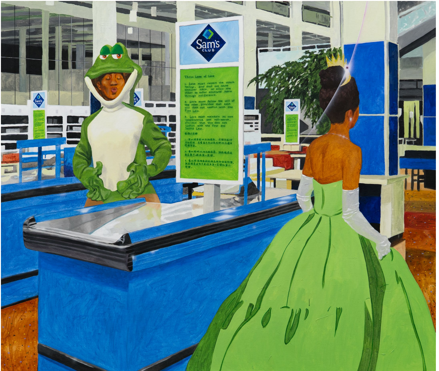
山姆定律 / Sam's Law | 2024 布面丙烯 / Acrylic on canvas 150 x 180cm