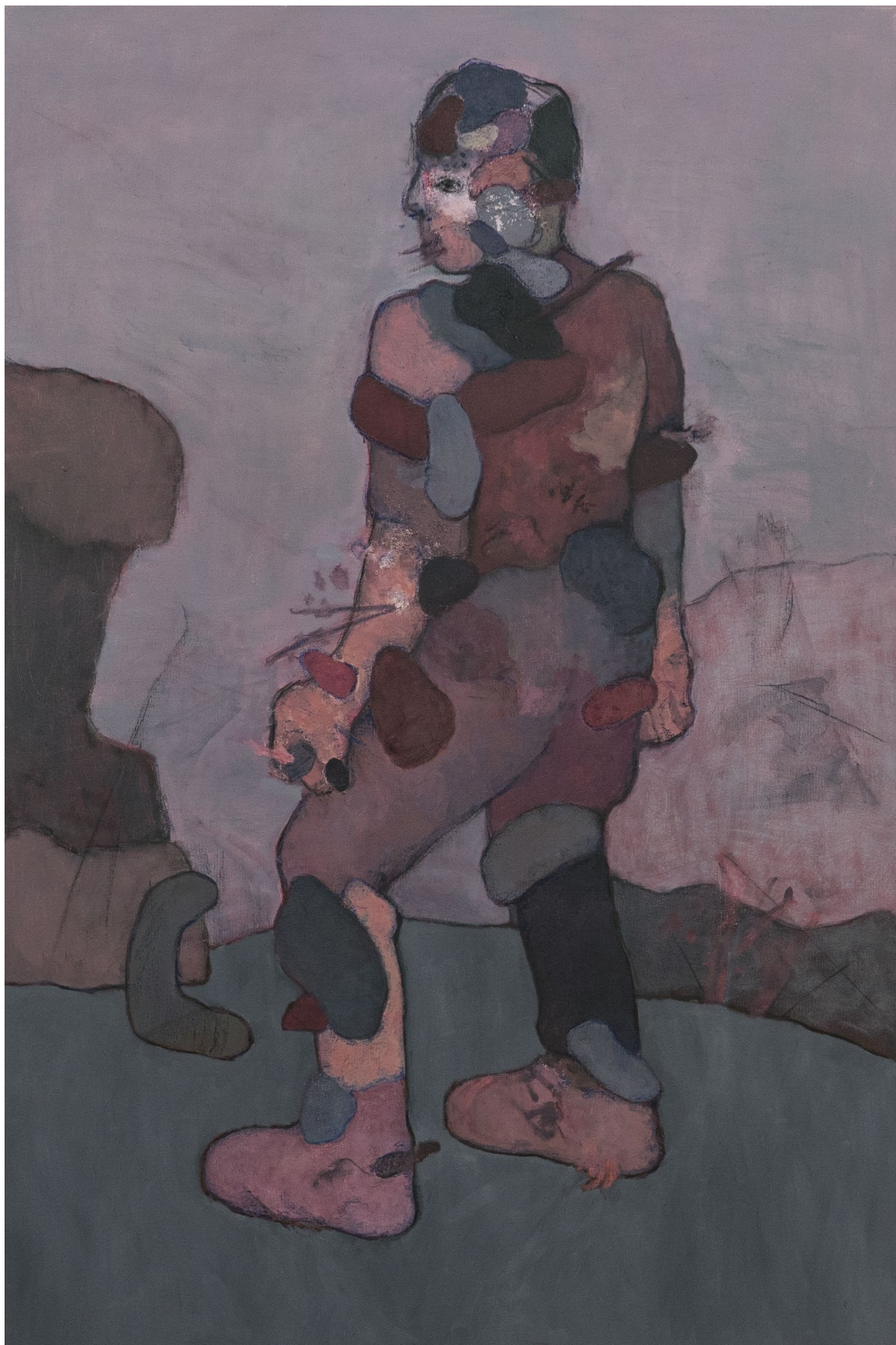
蹩脚演员 NO.5 / lame performer NO.5 | 2023 布面油画 / Oil on canvas 150 x 100cm