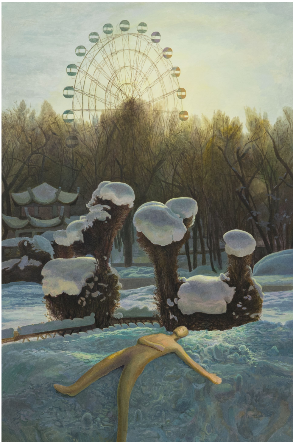
贤者 / Sage | 2023 布面丙烯 / Acrylic on canvas 120 x 180cm