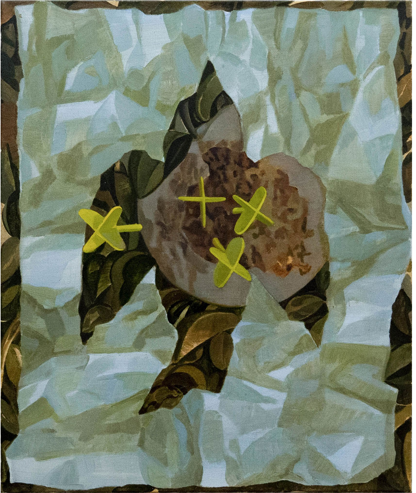
禁猎区 / Game Refuge | 2024 布面油画 / Oil on canvas 60 × 50 cm