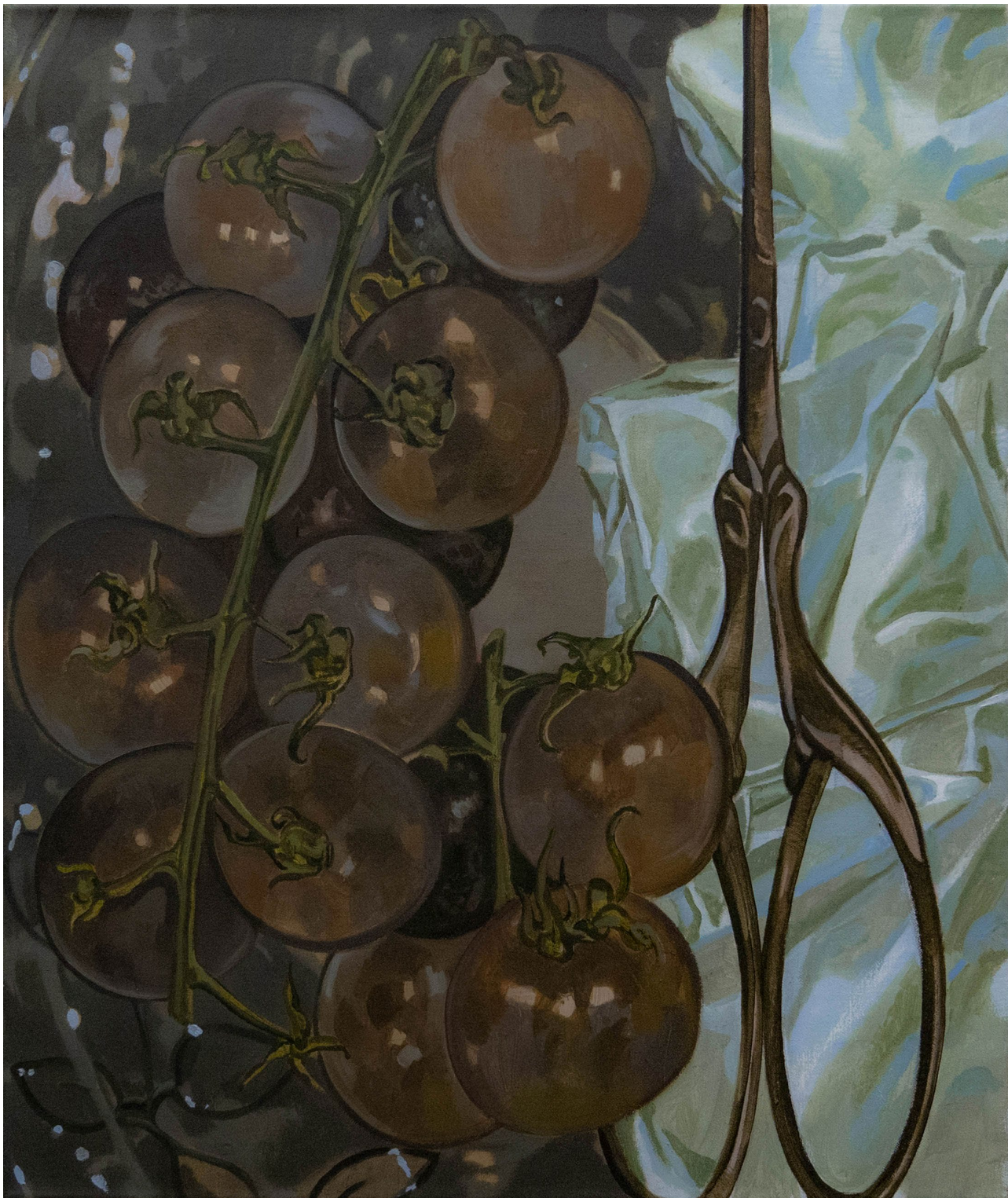
病灶 2 / Nidus 2 | 2024 布面油画 / Oil on canvas 60 × 50 cm