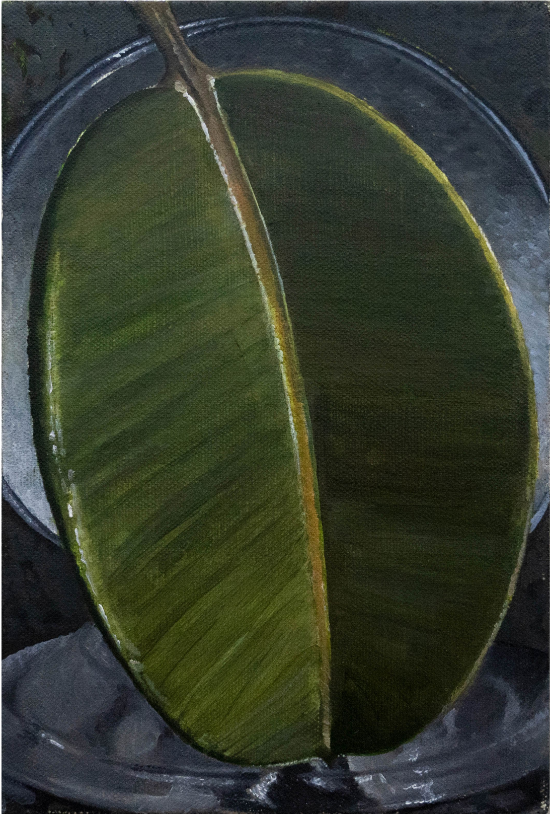
秘密 / Secret | 2023 布面油画 / Oil on canvas 30 × 21 cm