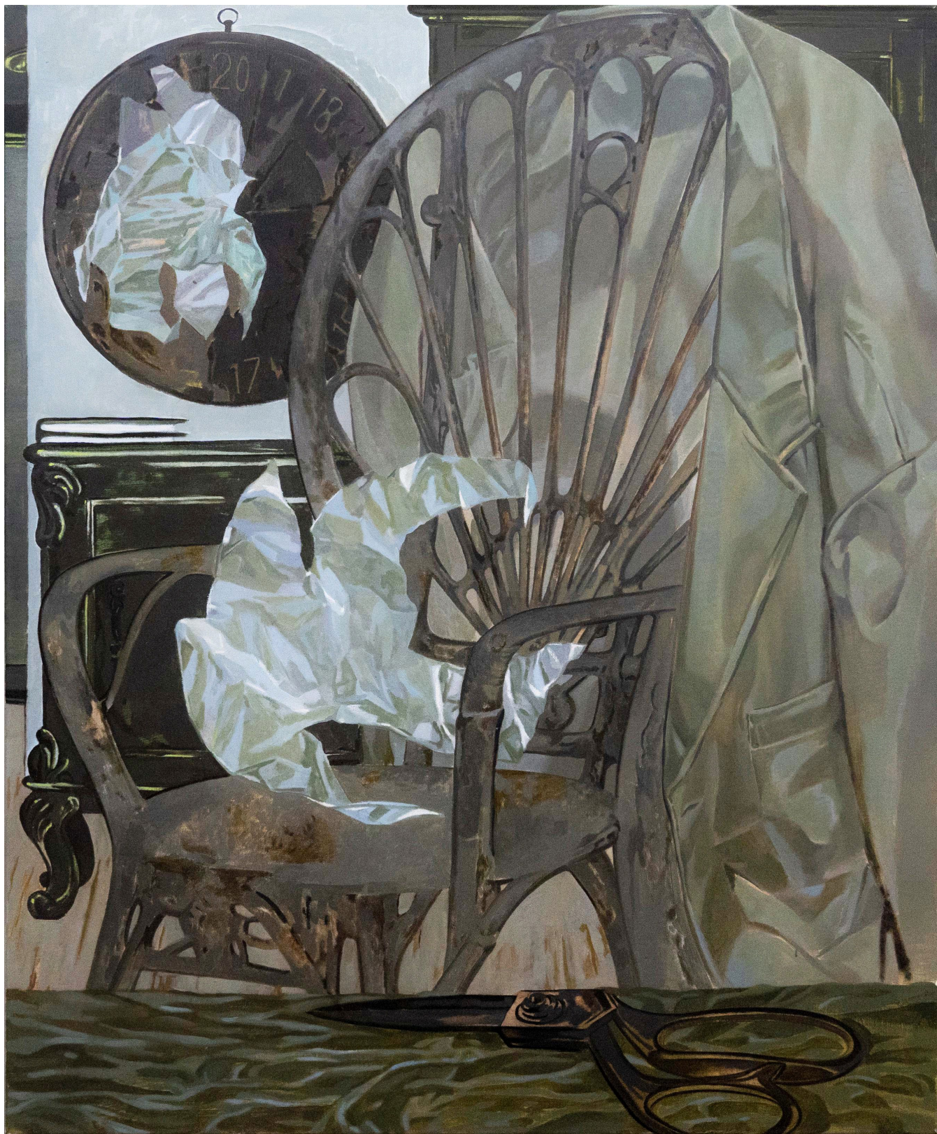
期许 2 / Expectations 2 | 2024 布面油画 / Oil on canvas 120 × 100 cm