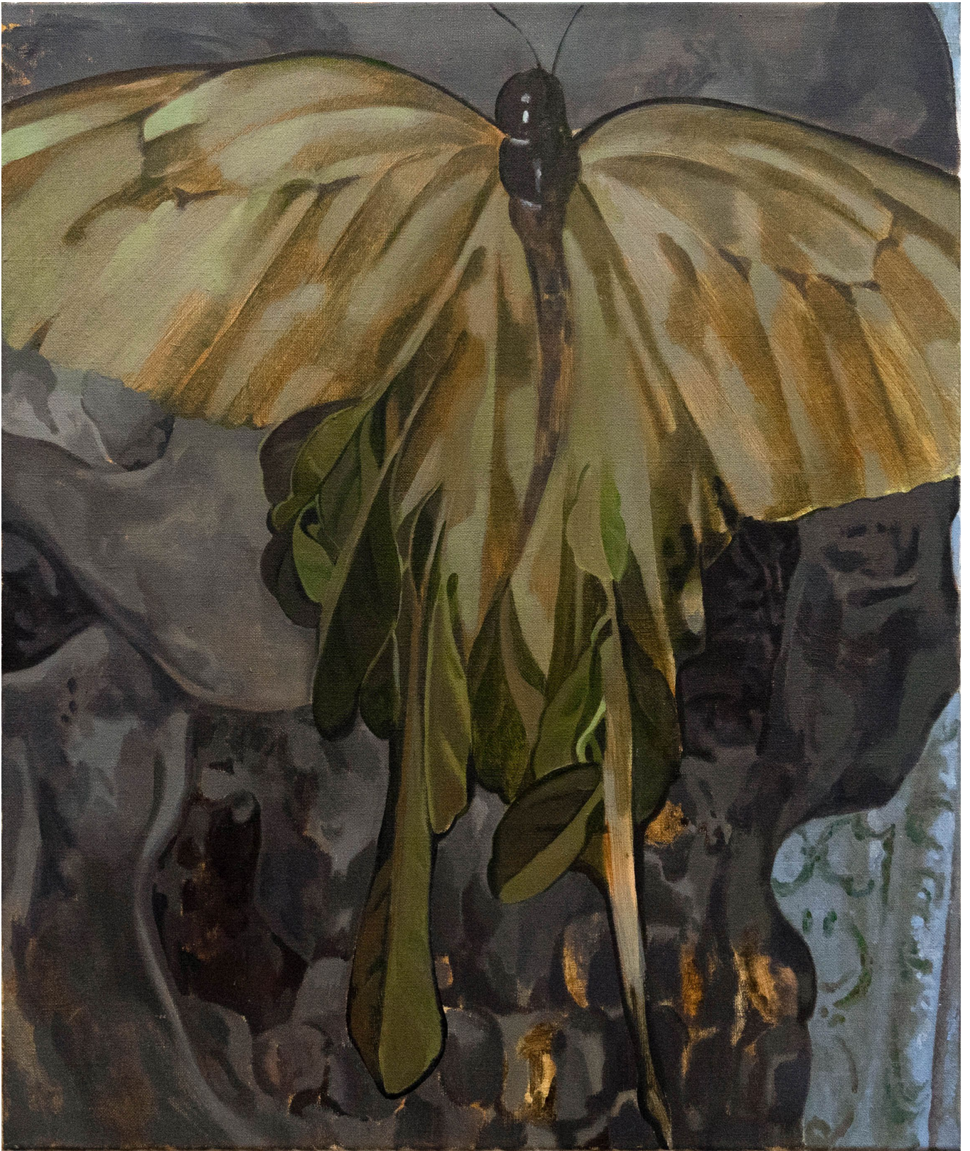
蝴蝶 / Butterfly | 2024 布面油画 / Oil on canvas 60 × 50 cm