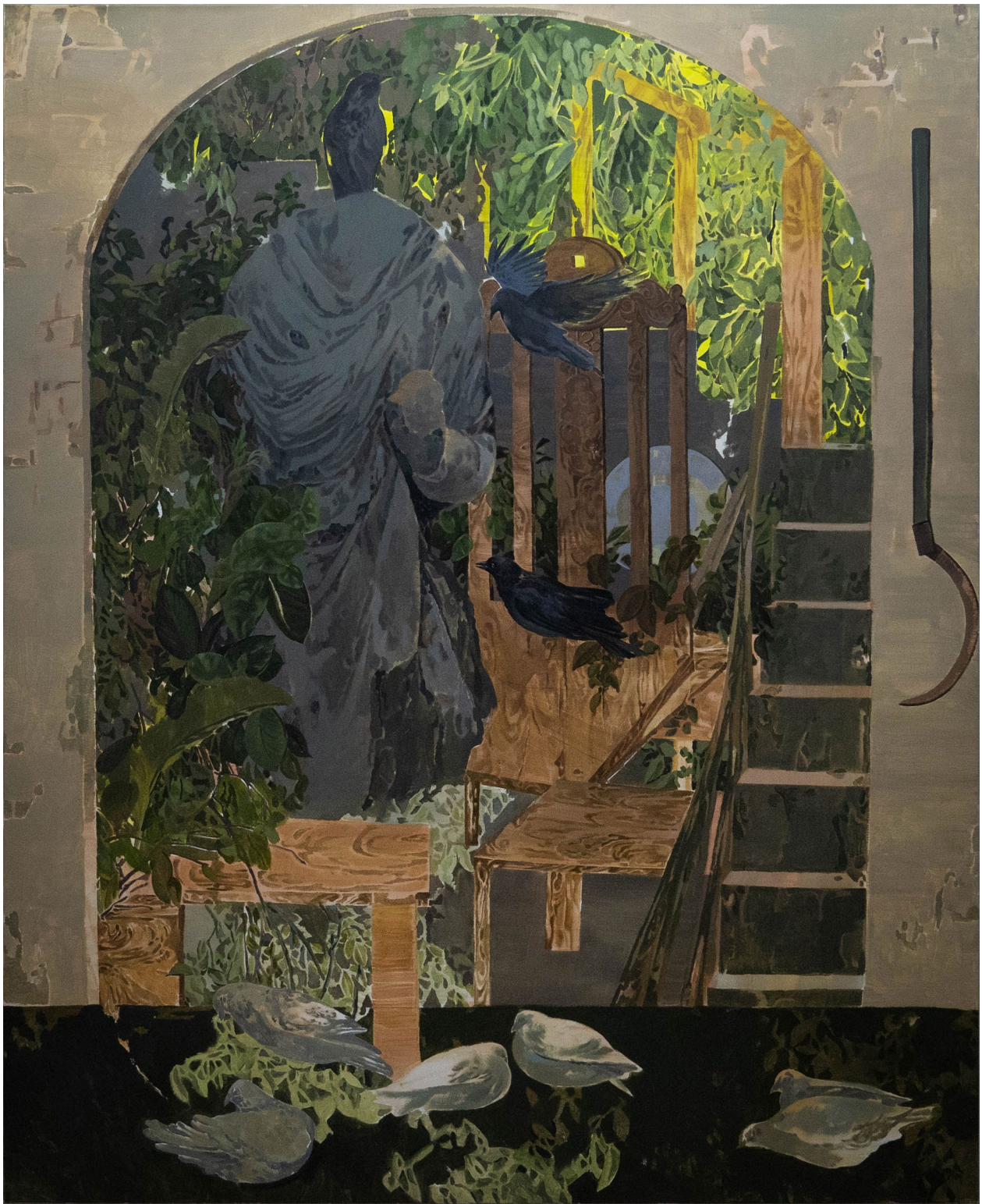
过多的期盼 / Excessive expectation | 2024 布面油画 / Oil on canvas 210 × 170 cm