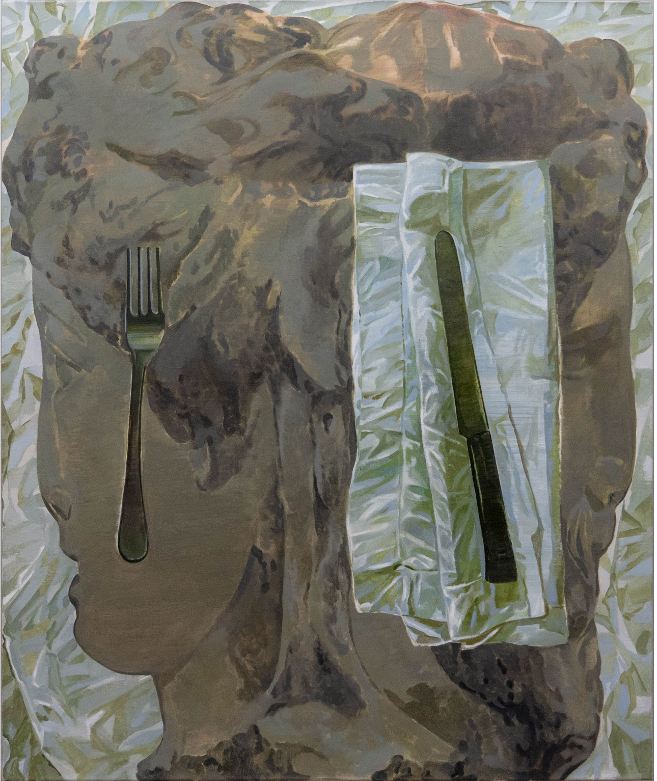
过多的期盼 2 / Excessive expectation 2 | 2024 布面油画 / Oil on canvas 120 × 100 cm