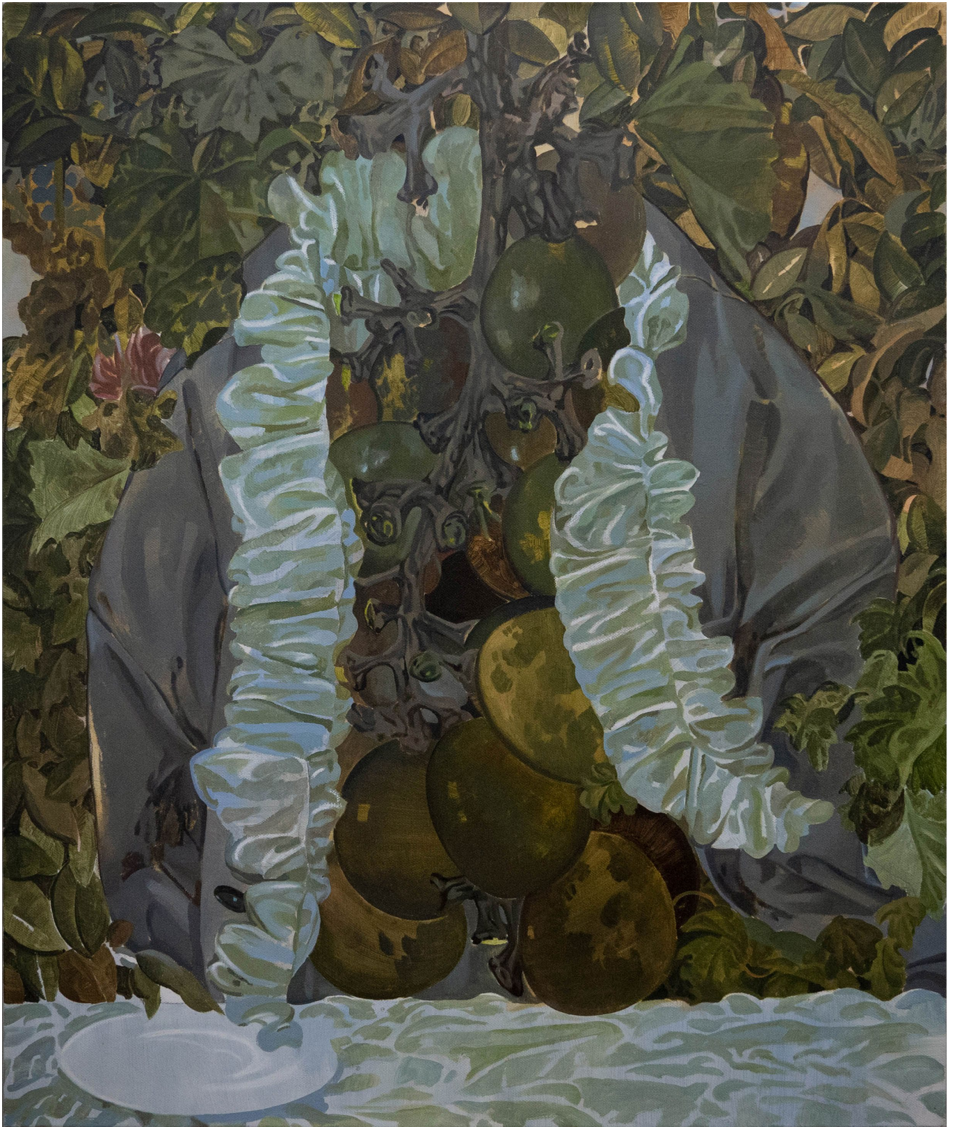
坦诚 / Sincerity | 2024 布面油画 / Oil on canvas 120 × 100 cm