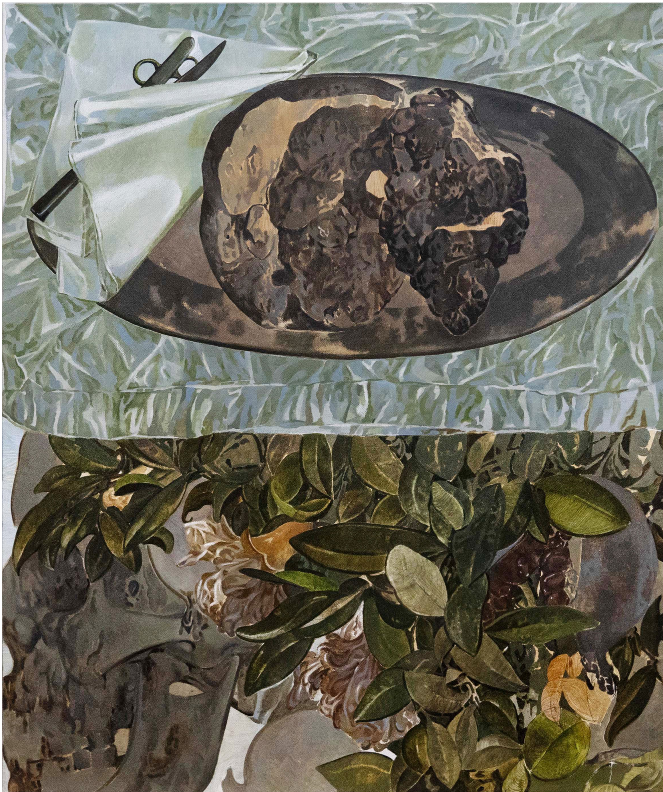
病灶 / Nidus | 2024 布面油画 / Oil on canvas 120 × 100 cm