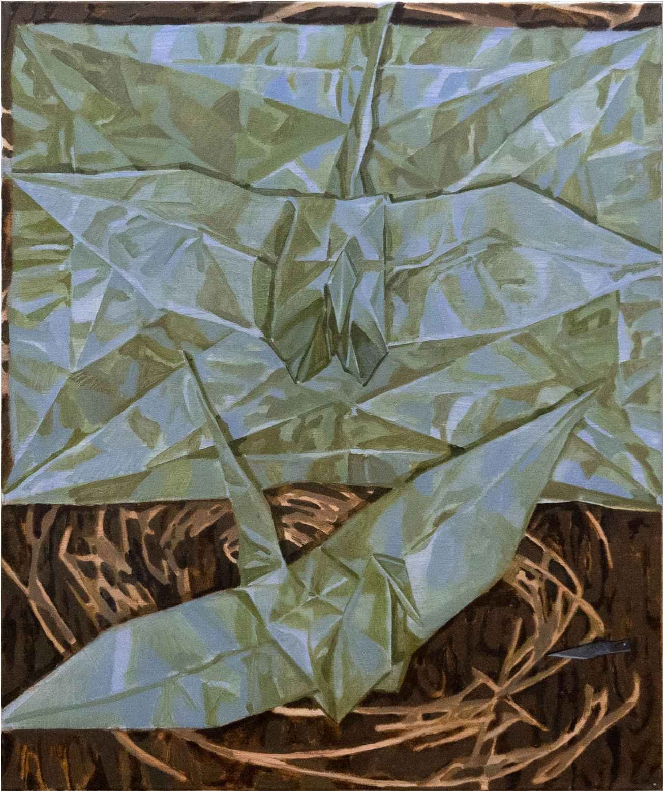
期许 / Expectations | 2024 布面油画 / Oil on canvas 60 × 50 cm