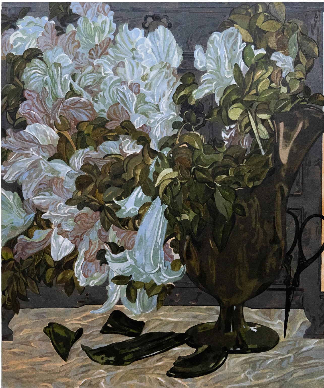
弥补 / Offset | 2024 布面油画 / Oil on canvas 120 × 100 cm