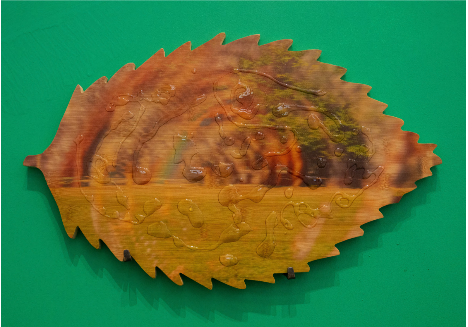
蜥蜴眼睛，叶子，彩虹 Lizard Eyes, Leaves, Rainbow 35cm × 56cm x 2cm UV油墨转印、树根切片 UV ink transfer, root slice 2024