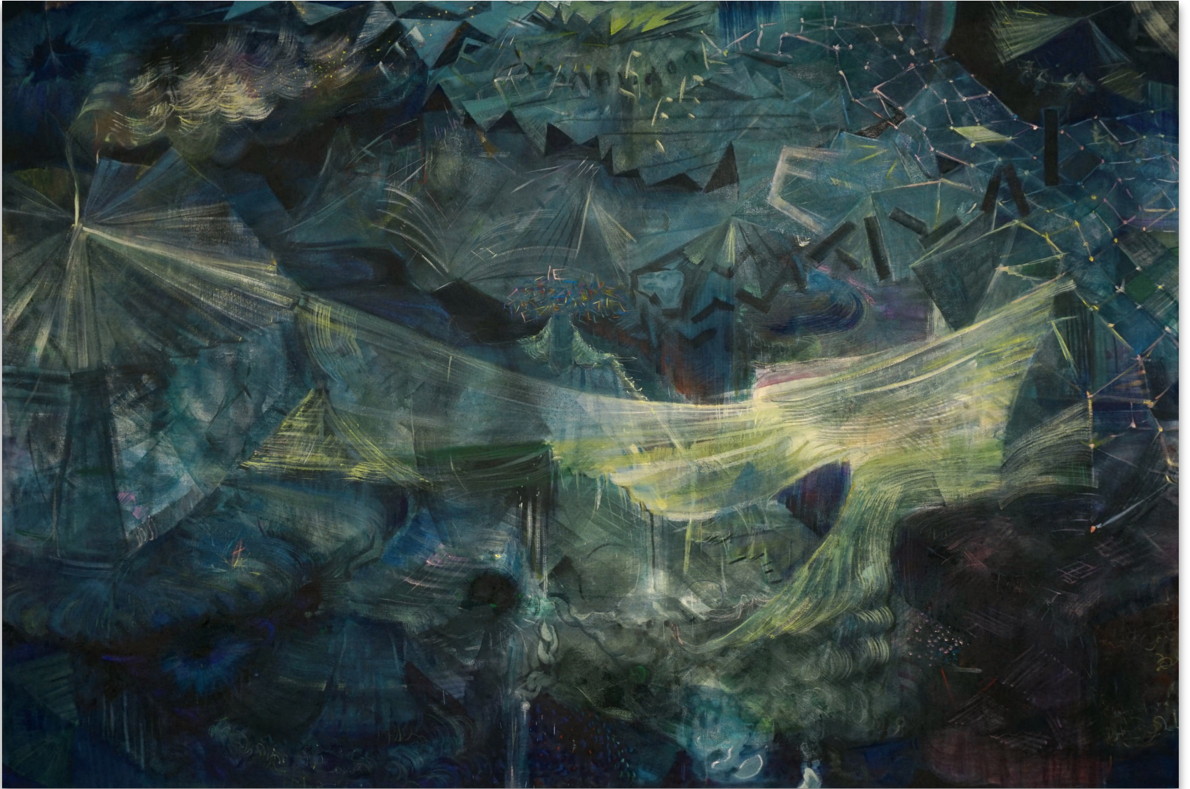
Flower's Gaze 130cm × 200cm 布面油画 Oil on linen 2024