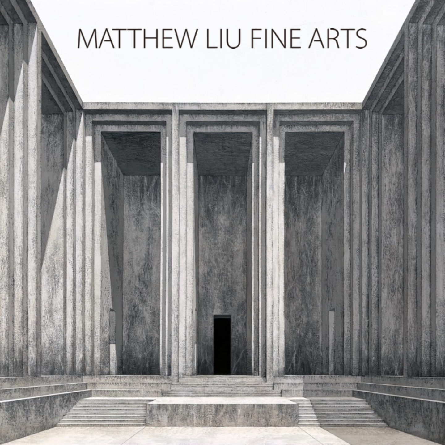
雷纳托·尼科洛迪 Renato Nicolodi 对称圣堂 III PORTICUS IN ANTIS III 布面丙烯 Acrylic on canvas 175 x 175 x 3.5 cm 2024