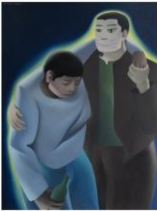
周猫和我 / Zhou's Cat and Me 布面油画 | Oil on canvas 120×90cm 2023