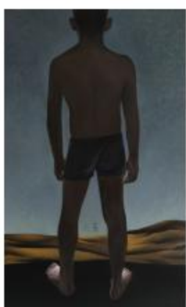
看风景 / Take In The Sights 布面油画 | Oil on canvas 130×80cm 2023