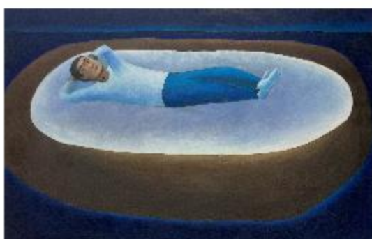
周猫在心中 / Zhou's Cat Is In My Heart 布面油画 | Oil on canvas 70×110cm 2024