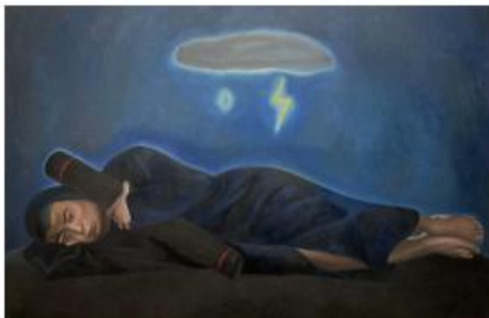
是雷是雨都要挨着 / No Matter If It's Thunder or Rain, One Must Face It. 布面油画 | Oil on canvas 130×200cm 2024