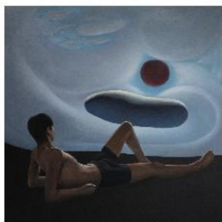
打赌 / Make a Bet 布面油画 | Oil on canvas 150×150cm 2023