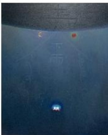
求雨 / Pray For Rain 布面油画 | Oil on canvas 150×120cm 2024