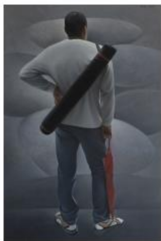
谁知道哪片云彩下面有雨 / Who Knows From Which Cloud the Rain Will Fall 布面油画 | Oil on canvas 150×100cm 2023