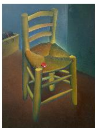
椅子和书 / A Chair and a book 布面油画 | Oil on canvas 120×90cm 2024