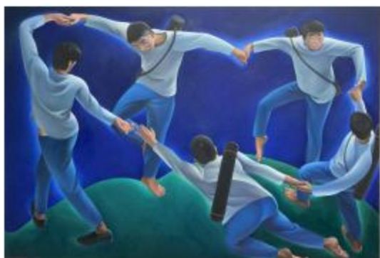
圈 / Circle 布面油画 | Oil on canvas 150×220cm 2023