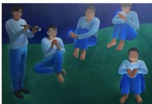
看 / Look 布面油画 | Oil on canvas 150×220cm 2024