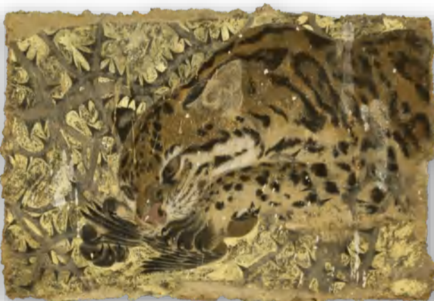
结局在夜晚时分-4 | The ending occurs in the evening hours

木板、麻布、麦秸、黄土、明胶、墨等|Wood board, burlap, wheat straw, loess, gelatin, ink,etc