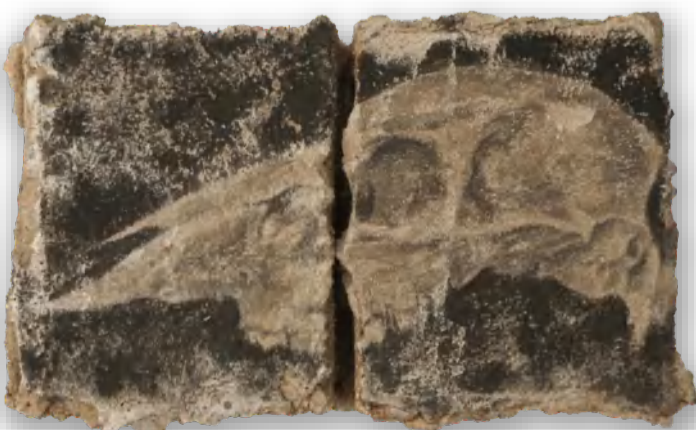
干枯的记忆 | Withered Momeries

木板、麻布、麦秸、黄土、明胶、墨等 | Wood board, burlap, wheat straw, loess, gelatin, ink, etc