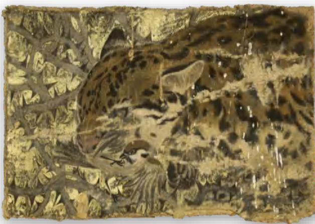
结局在夜晚时分-3 | The ending occurs in the evening hours

木板、麻布、麦秸、黄土、明胶、墨等|Wood board, burlap, wheat straw, loess, gelatin, ink,etc