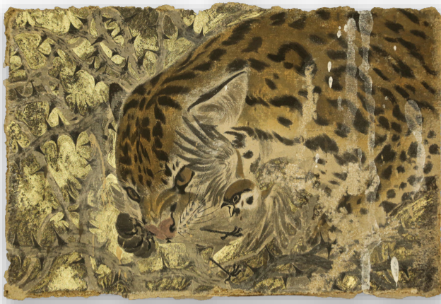
结局在夜晚时分-2 | The ending occurs in the evening hours

木板、麻布、麦秸、黄土、明胶、墨等|Wood board, burlap, wheat straw, loess, gelatin, ink,etc