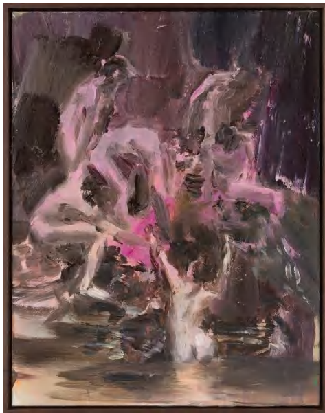
Wei Jia, Untitled , 2018, Acrylic on canvas, 90x70cm