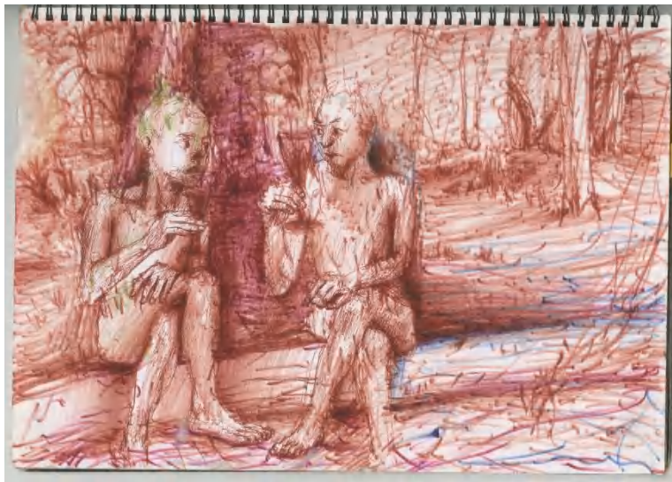
Wei Jia, Drunk like an Inverted Empty Cup (Manuscript), 2010, Water-based ink on paper, 26x37cm