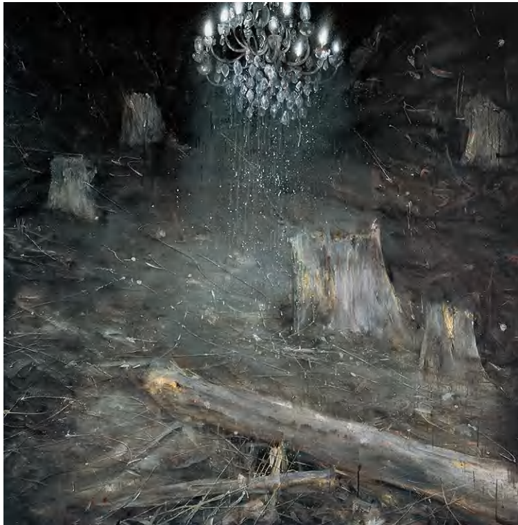
韦嘉, 《照亮夜色无垠 VII》, 2008, 丙烯画布, 180x180cm