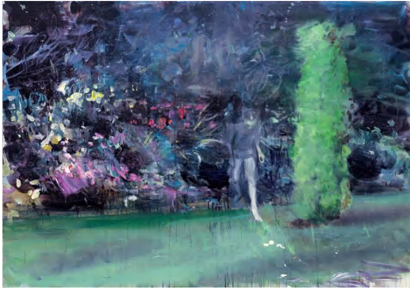
Wei Jia, Youth Survivor of a Bygone Age , 2016, Acrylic on canvas, 190x270cm