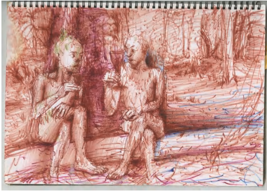
韦嘉, 《空杯醉》手稿, 2010, 水性笔纸本, 26x37cm