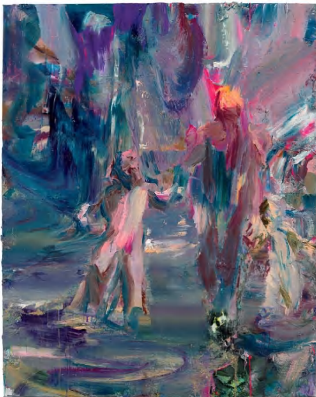
韦嘉,《劲旅 II》, 2021, 丙烯画布, 150x120cm