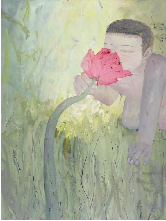
Wei Jia, Flower and Tree Boy I , 2006, Acrylic on canvas, 200×150cm