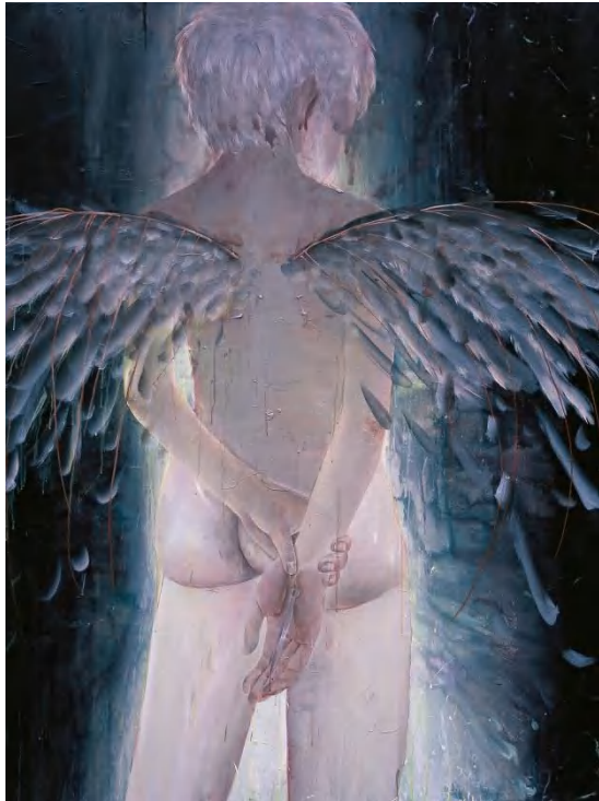
Wei Jia, Flight Taboo II , 2008, Acrylic on canvas, 200×150cm