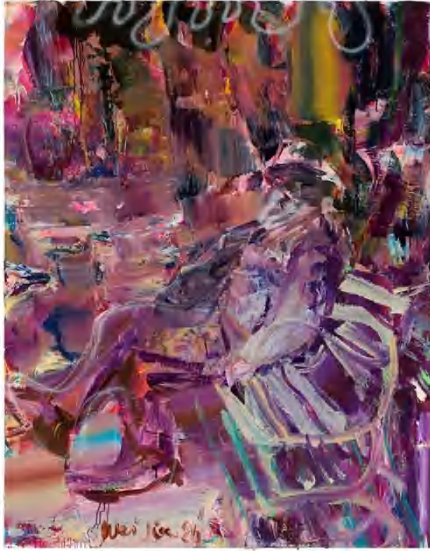
Wei Jia, Dusk , 2024, Acrylic on canvas, 205×160cm