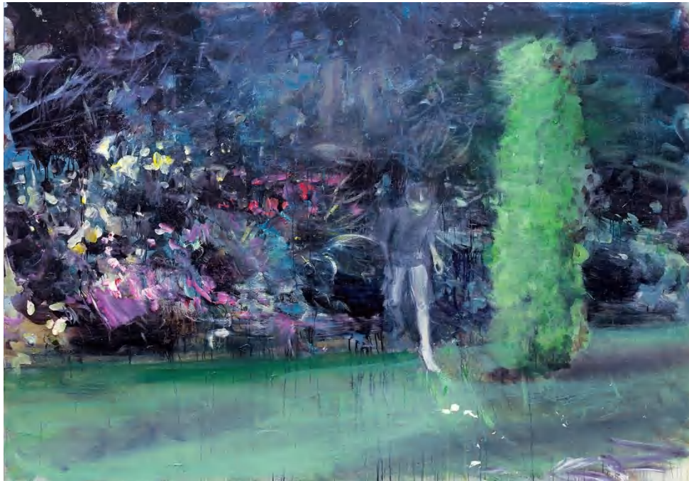
韦嘉, 《遗少》, 2016, 丙烯画布, 190x270cm