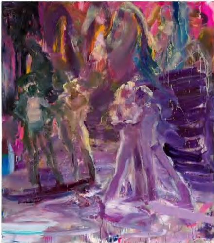
Wei Jia, Lost in Luscious Spring , 2022, Acrylic on canvas, 230x205cm