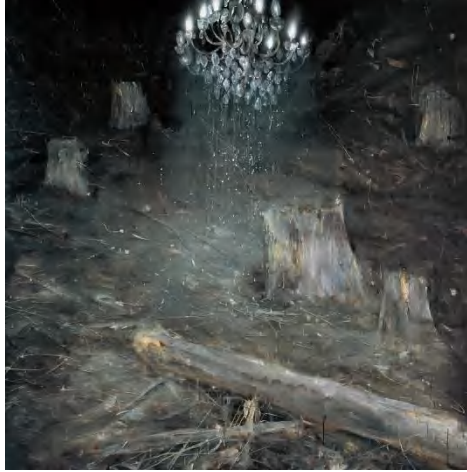
Wei Jia, Illuminating the Endless Night VII , 2008, Acrylic on canvas, 180×180cm