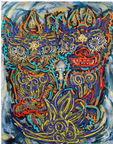
双生的守护狻猊 | Twin guardian dogs 2024 布面丙烯 | Acrylic on canvas 116.7 x 91.0 cm