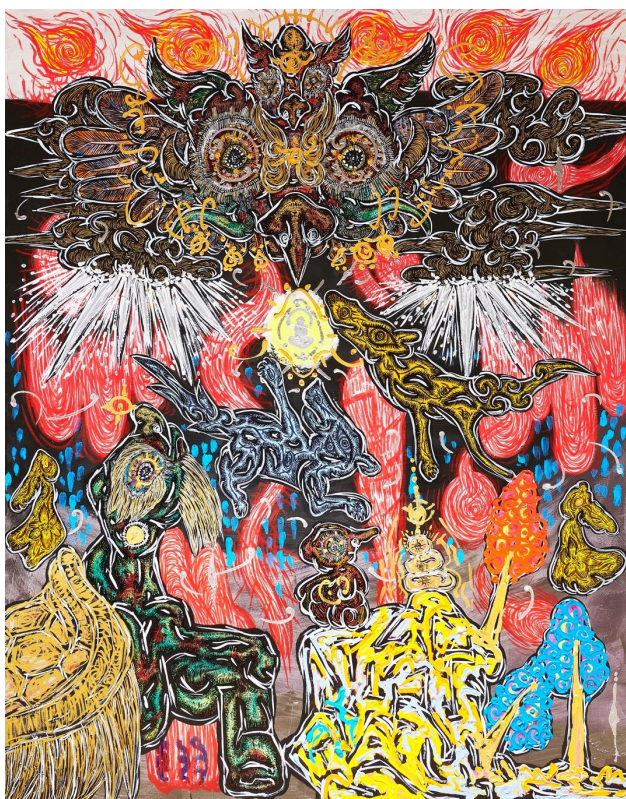
火鸟栖息之地 | A place where the firebird lives 2024

布面丙烯 | Acrylic on canvas 227.3 x 181.8 cm