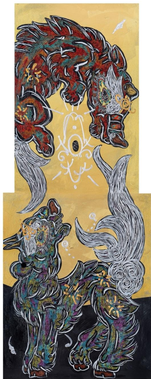
欢喜的飞跃 | Leap of joy 2024 布面丙烯 | Acrylic on canvas 182.0 x 72.7 cm