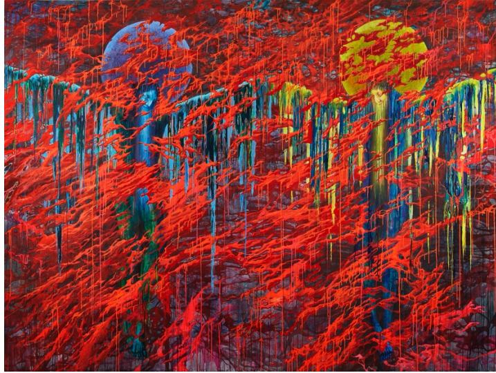
Chi Peng, Who decides?

200.0 x 270.0 cm | Acrylic on canvas | 2023