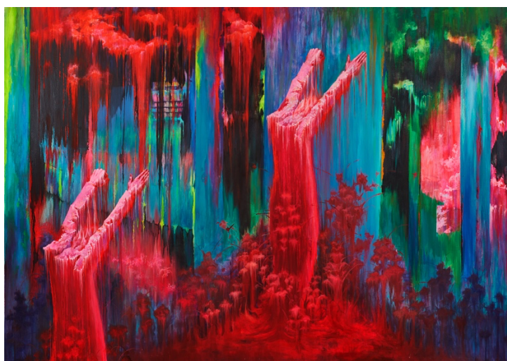
Chi Peng, Another successor

220.0 x 160.0 cm | Acrylic on canvas | 2023