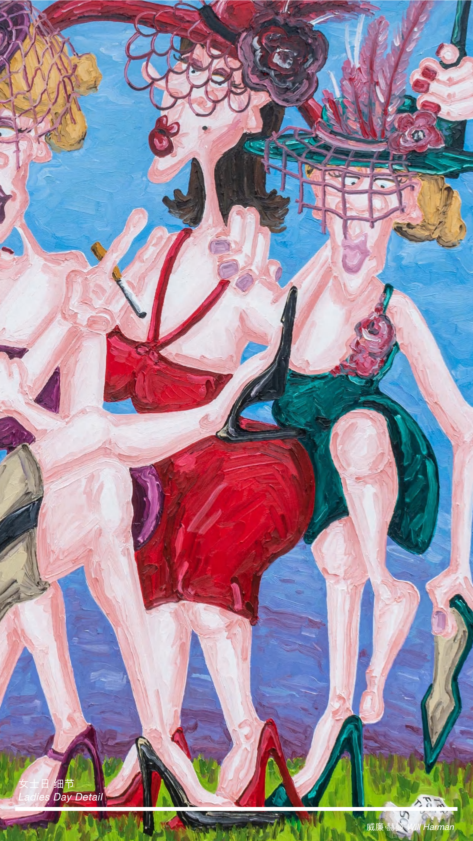
女士日 细节 Ladies Day Detail