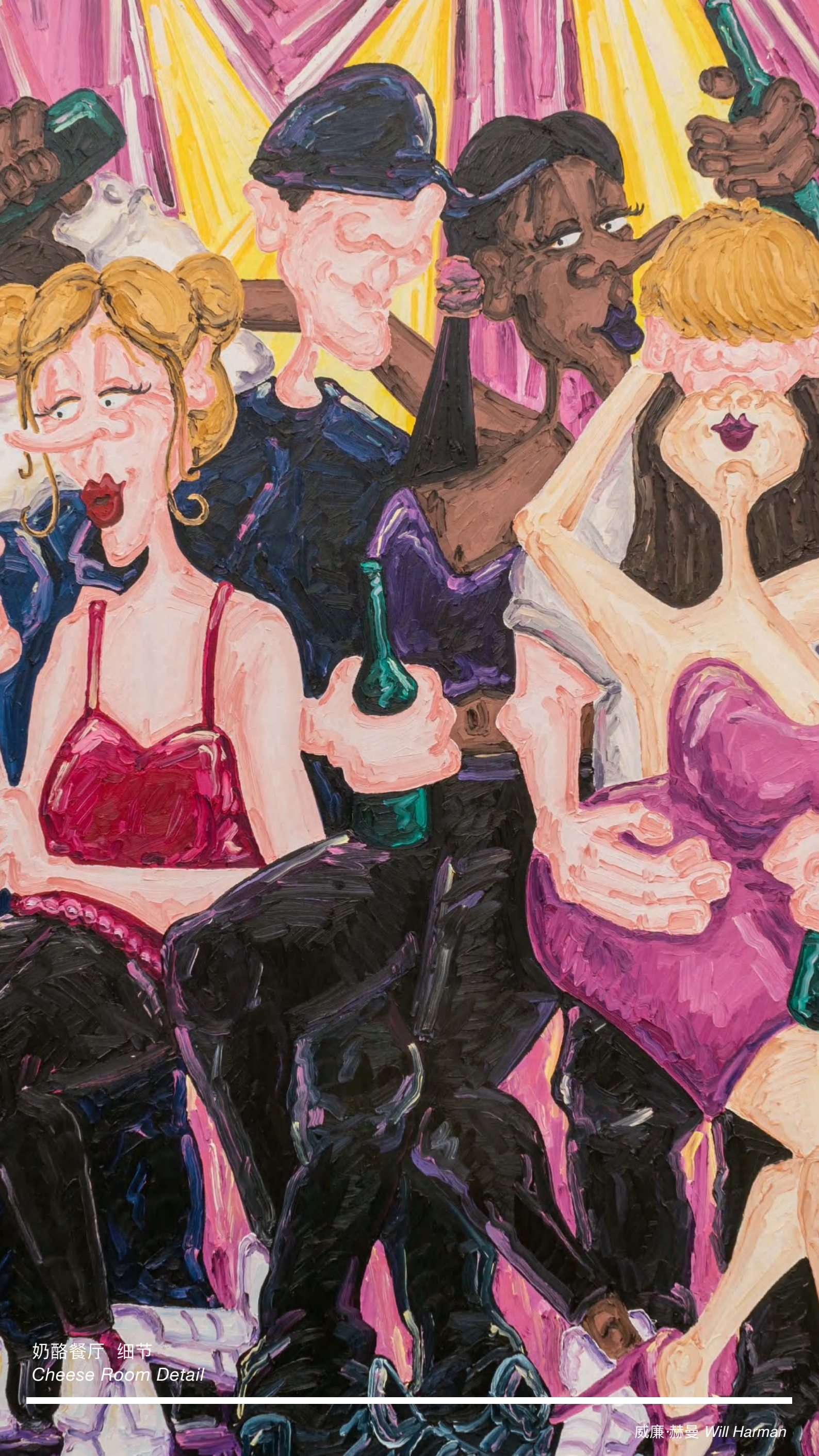
奶酪餐厅 细节 Cheese Room Detail