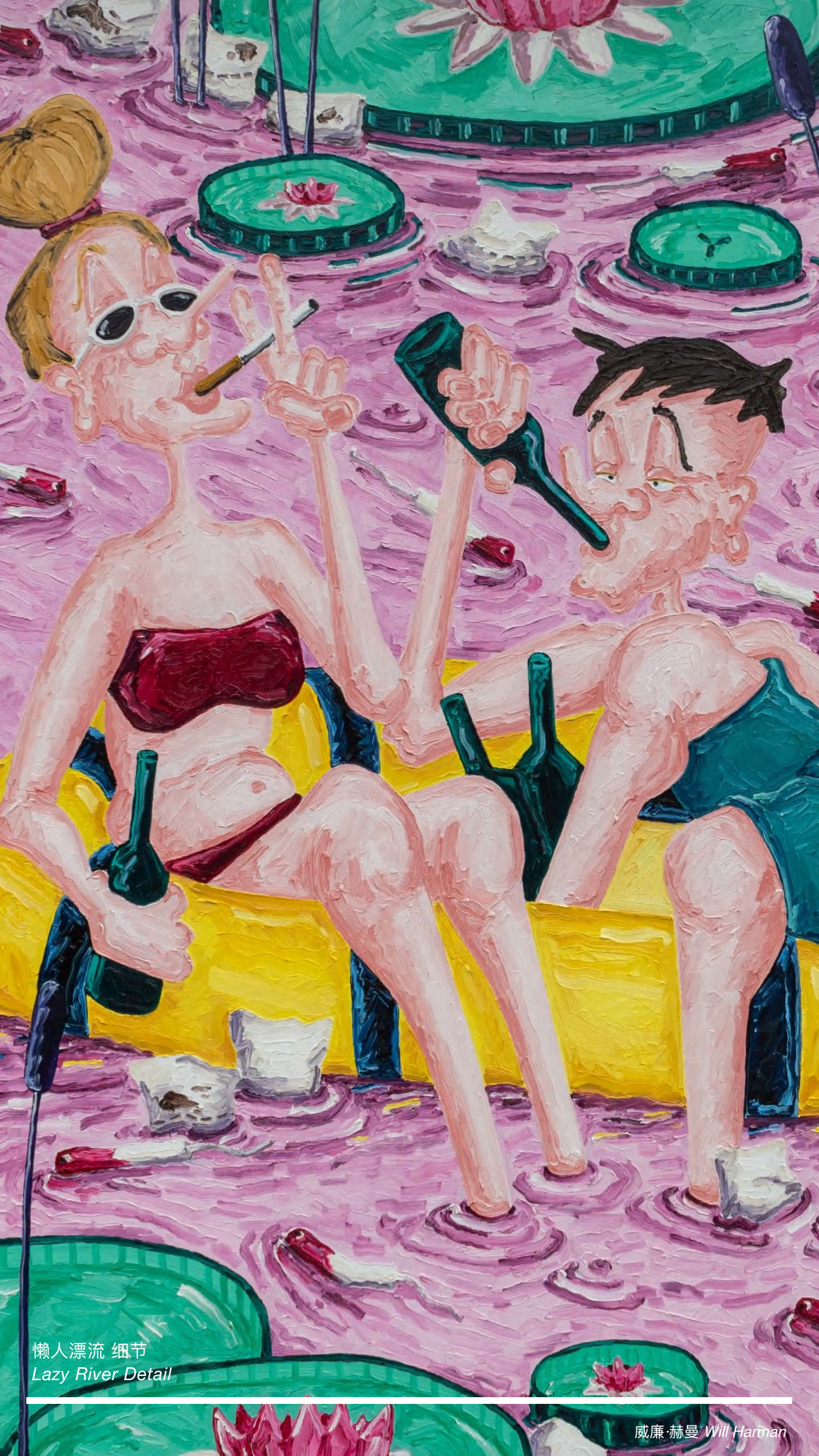
懒人漂流 细节 Lazy River Detail