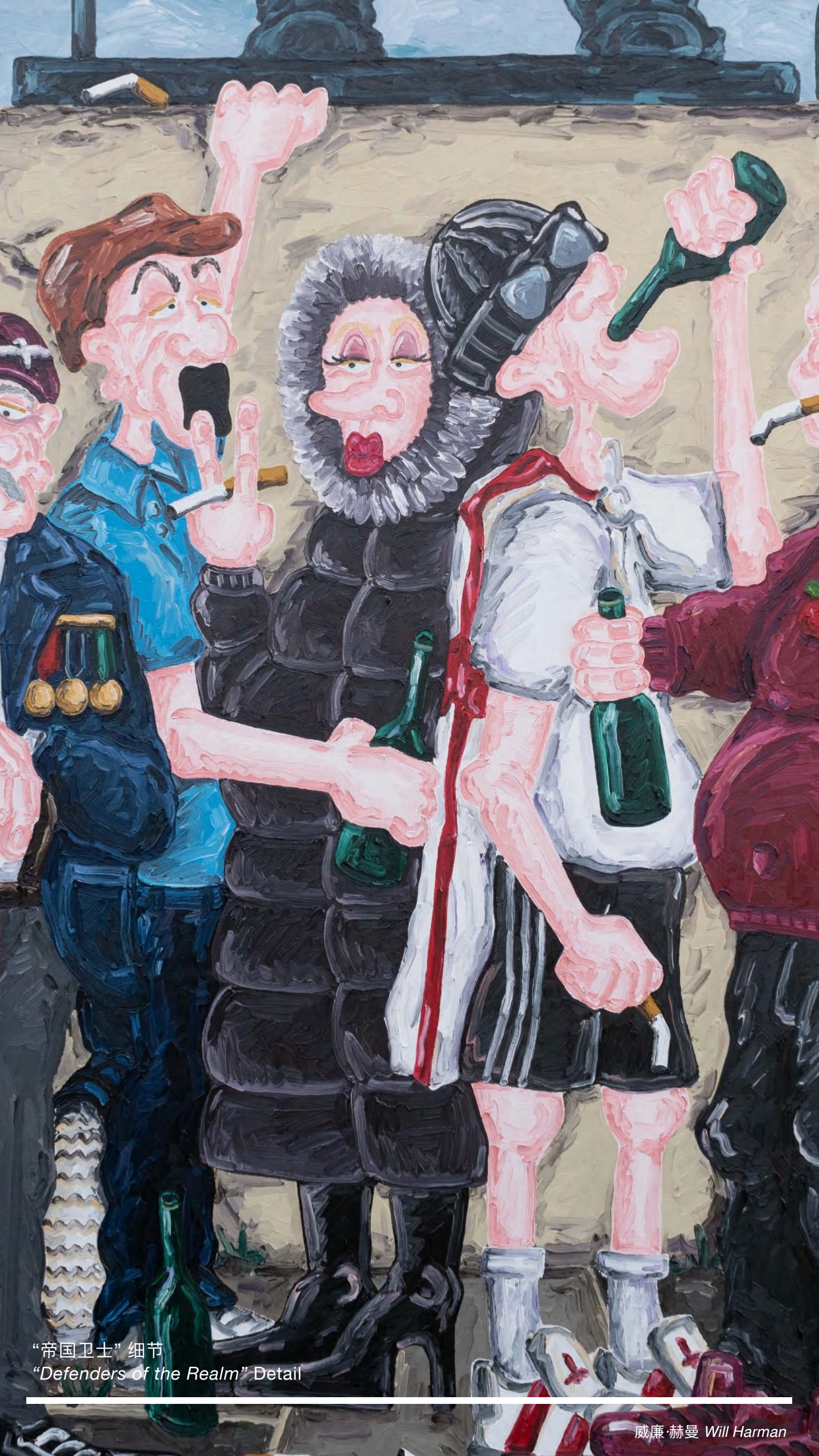
“帝国卫士”细节 “Defenders of the Realm” Detail