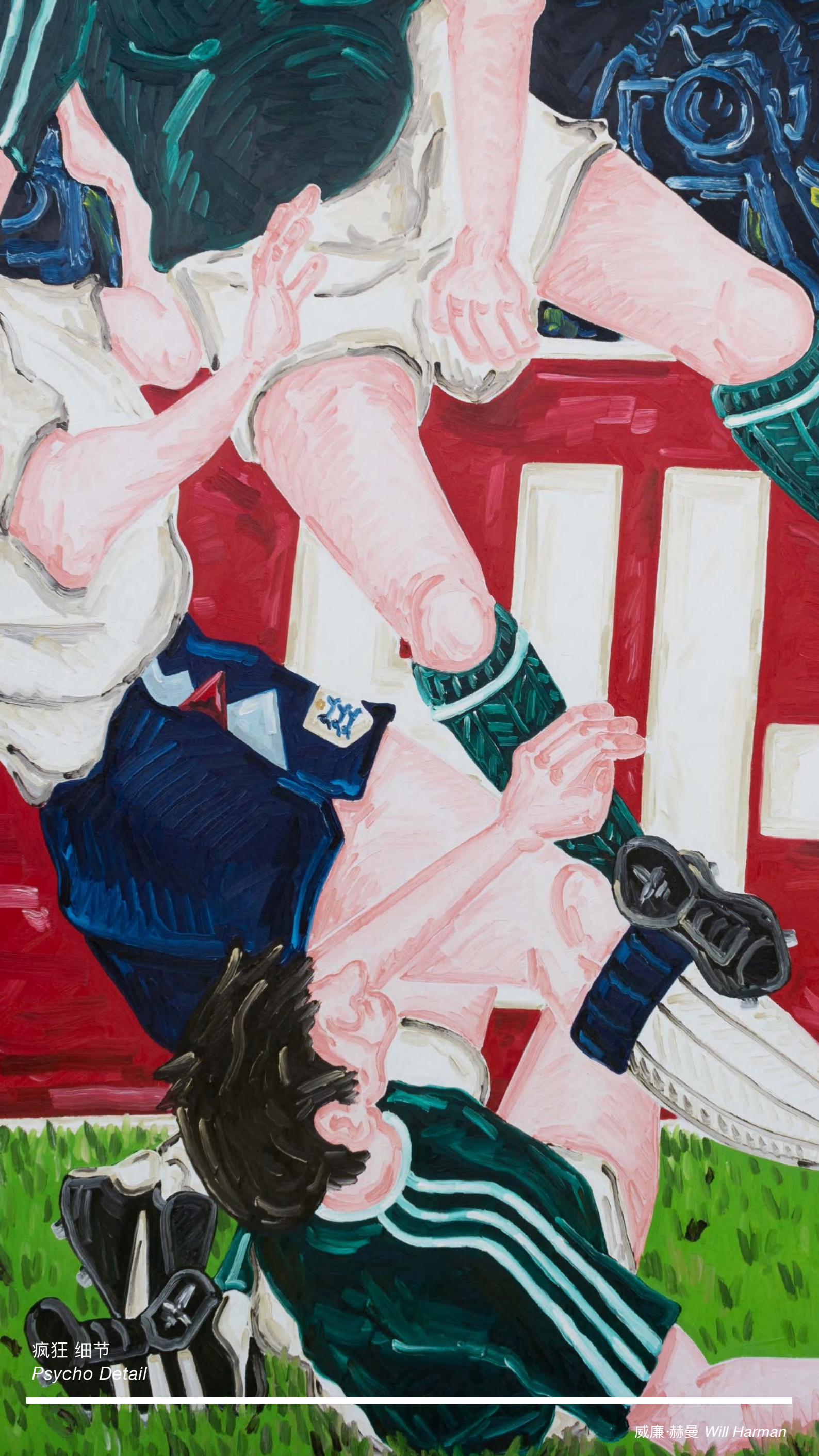
疯狂 细节 Psycho Detail