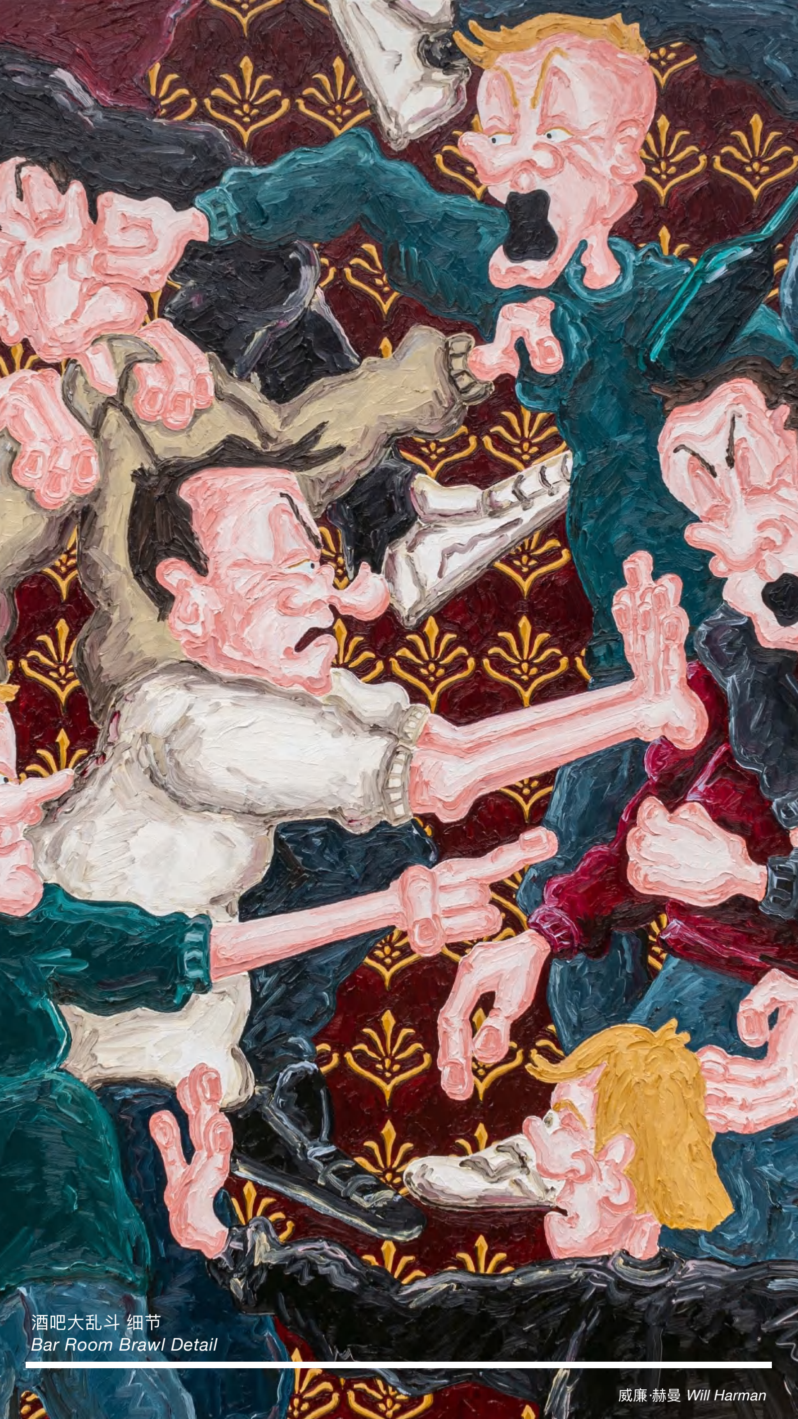
酒吧大乱斗 细节 Bar Room Brawl Detail