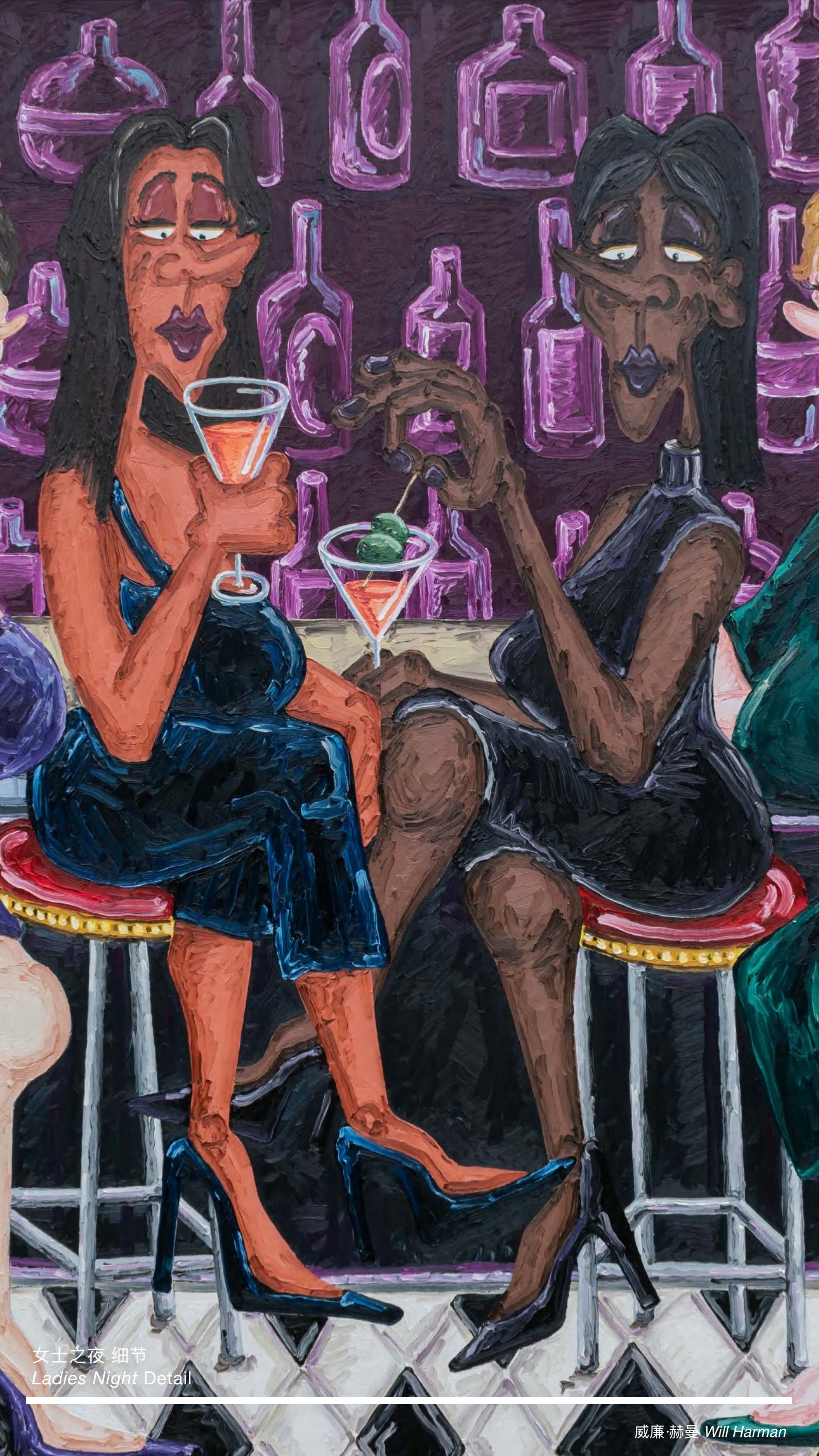
女士之夜 细节 Ladies Night Detail