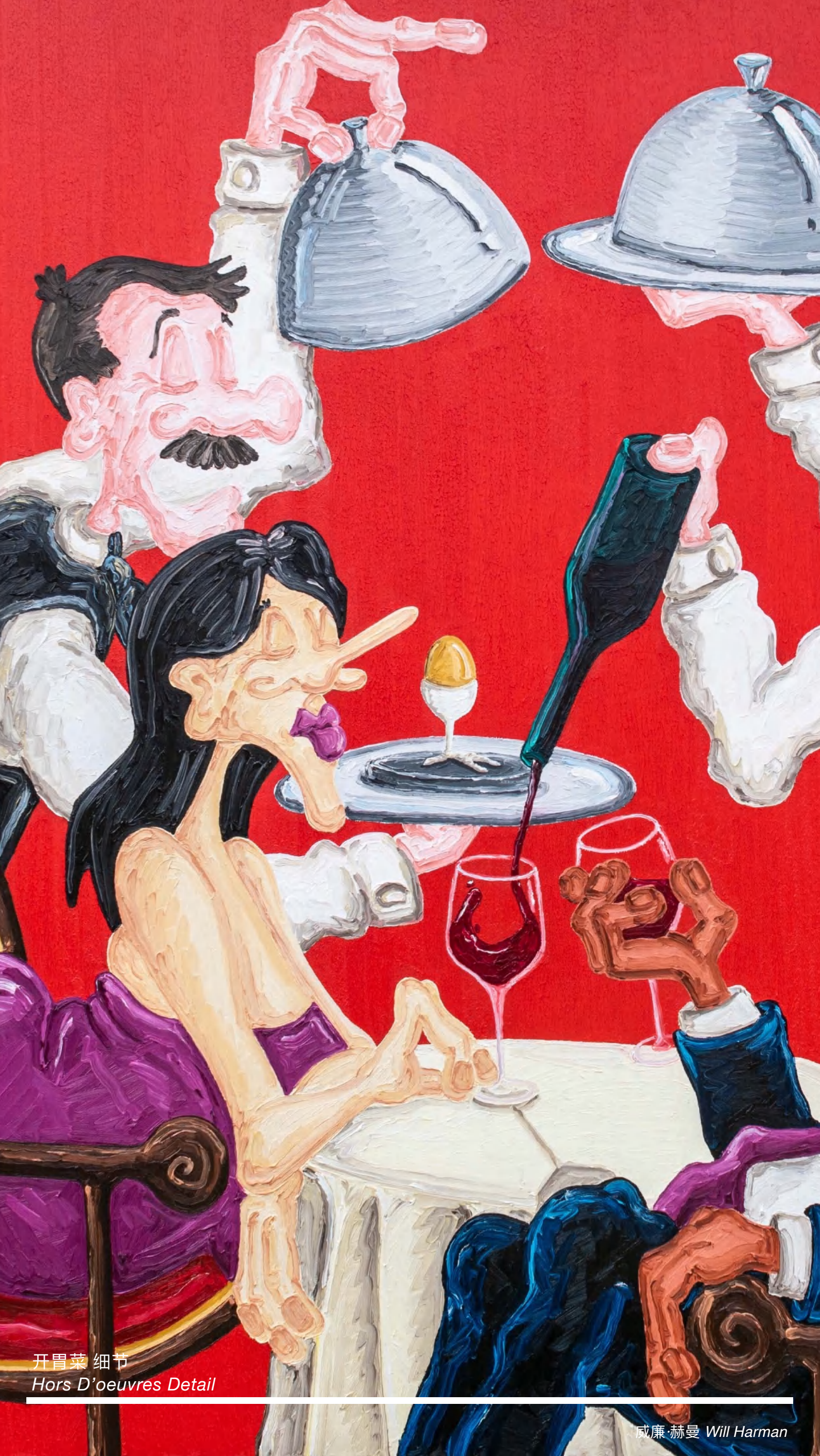
开胃菜 细节 Hors D'oeuvres Detail