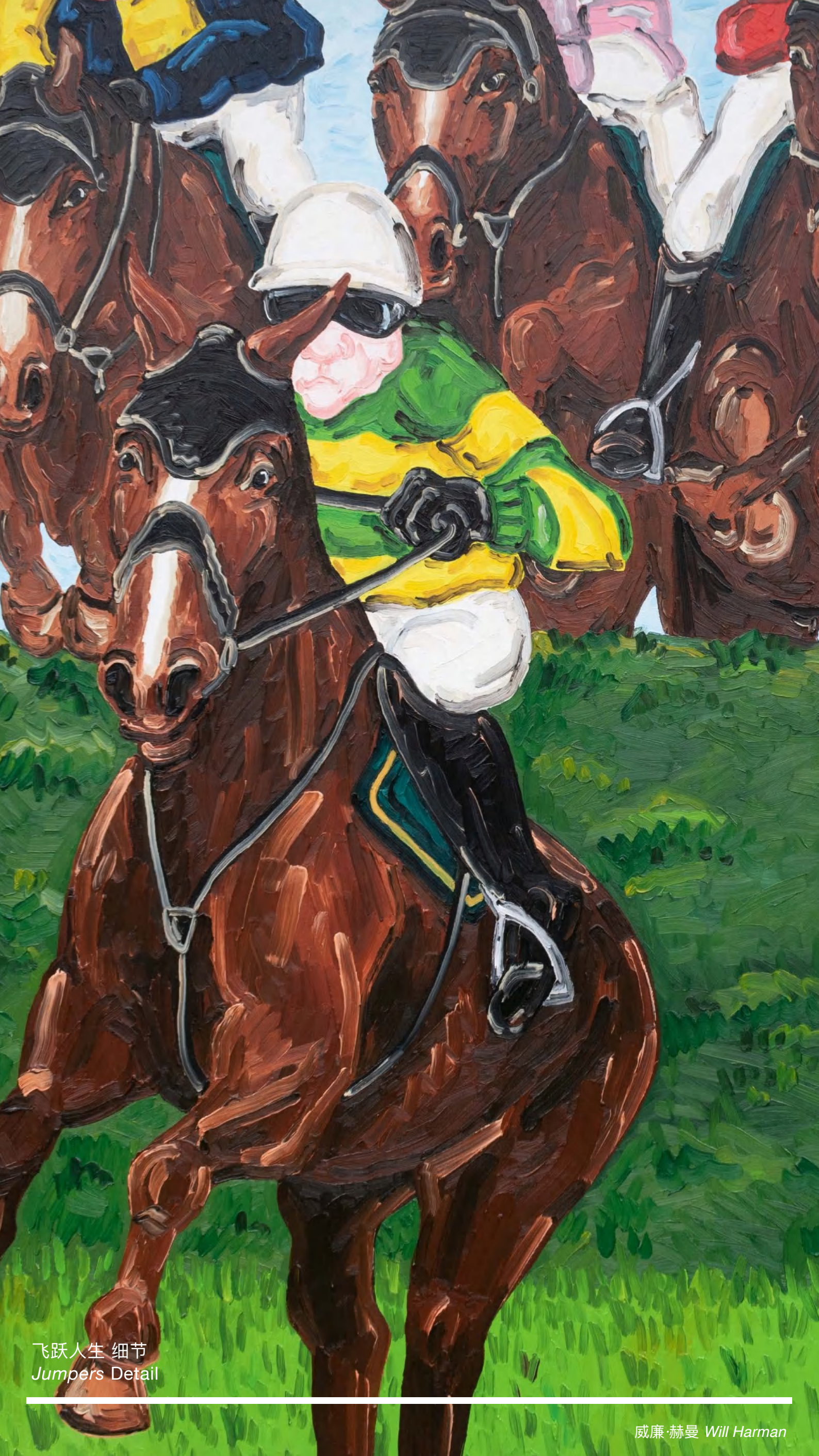
飞跃人生 细节 Jumpers Detail