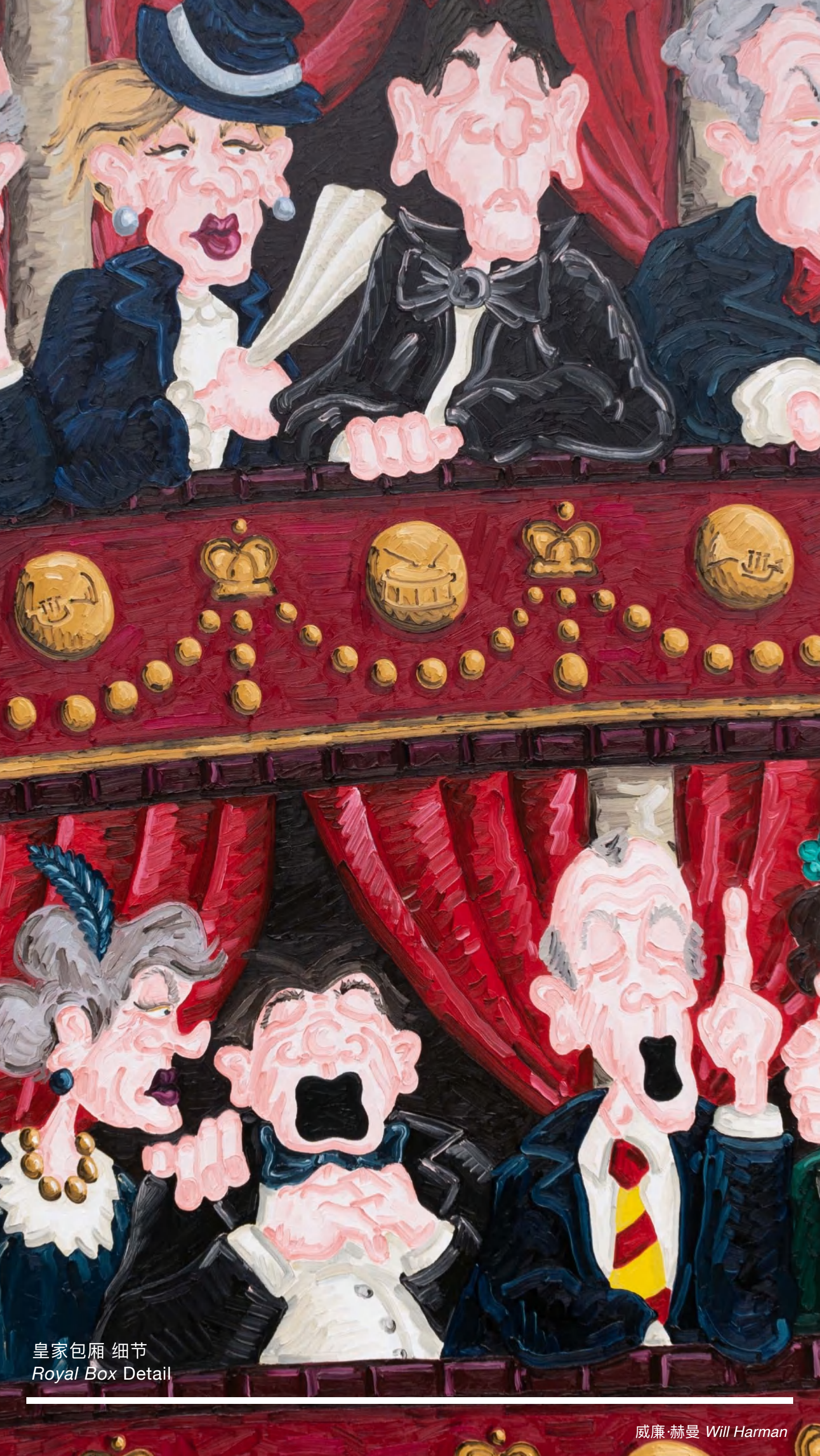
皇家包厢 细节 Royal Box Detail