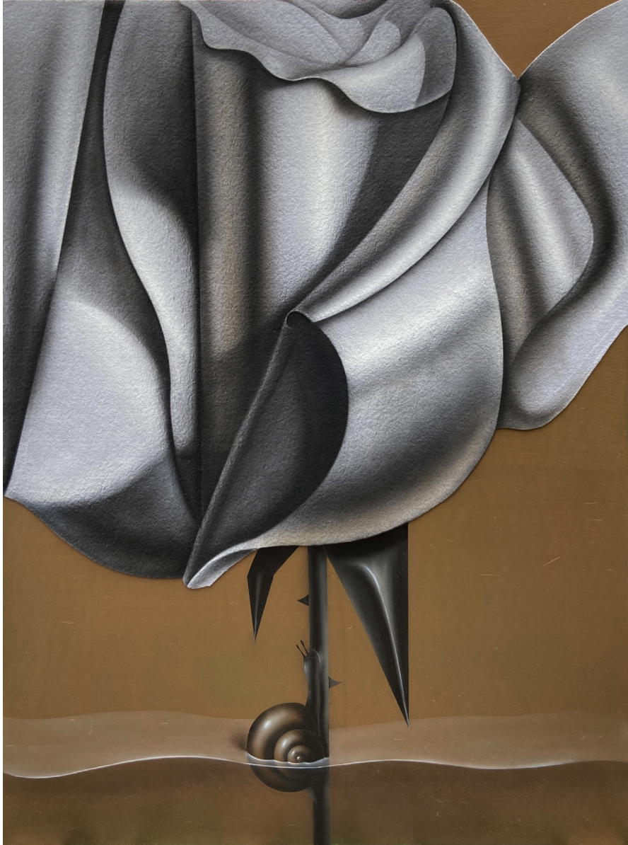
玫瑰, 2024 布面丙烯、毛毡拼贴 120 x 90 cm