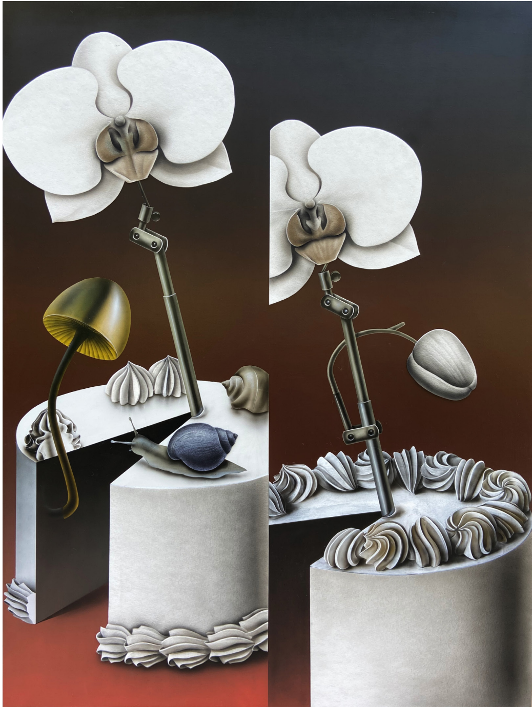
错位与共存，2023 布面丙烯、毛毡拼贴 200 x 150 cm