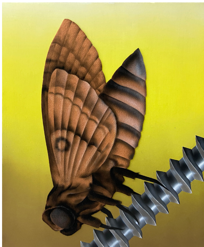
此刻，2024 布面丙烯、毛毡拼贴 60 x 50 cm