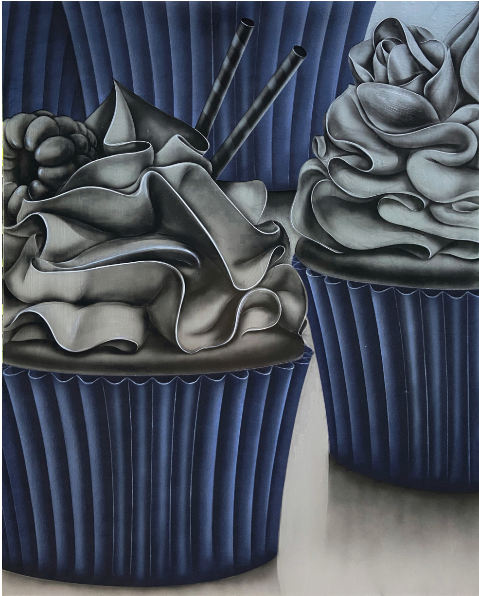
包裹着的欲望 NO.3, 2024 布面丙烯、毛毡拼贴 150 x 120 cm