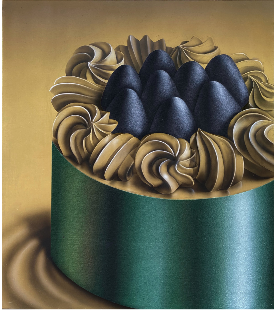
等待着一个时刻的到来, 2024 布面丙烯、毛毡拼贴 85 x 75 cm