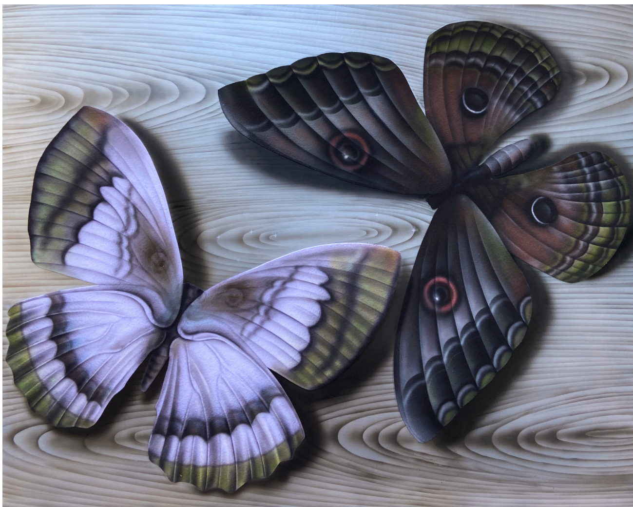
彷徨的，灿烂的，对视的，2024 布面丙烯、毛毡拼贴 150 x 120 cm