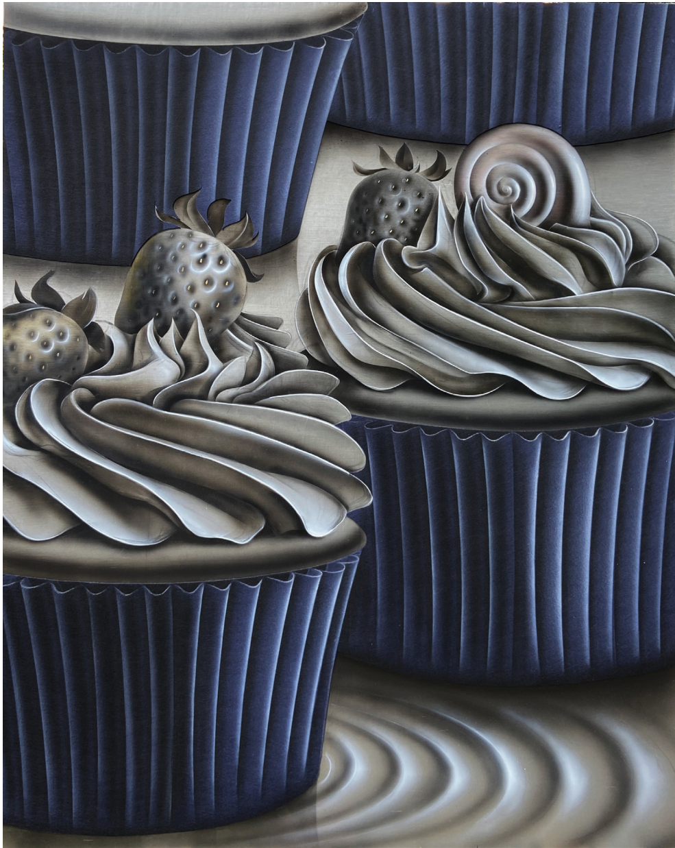
包裹着的欲望 NO.1, 2024 布面丙烯、毛毡拼贴 150 x 120 cm