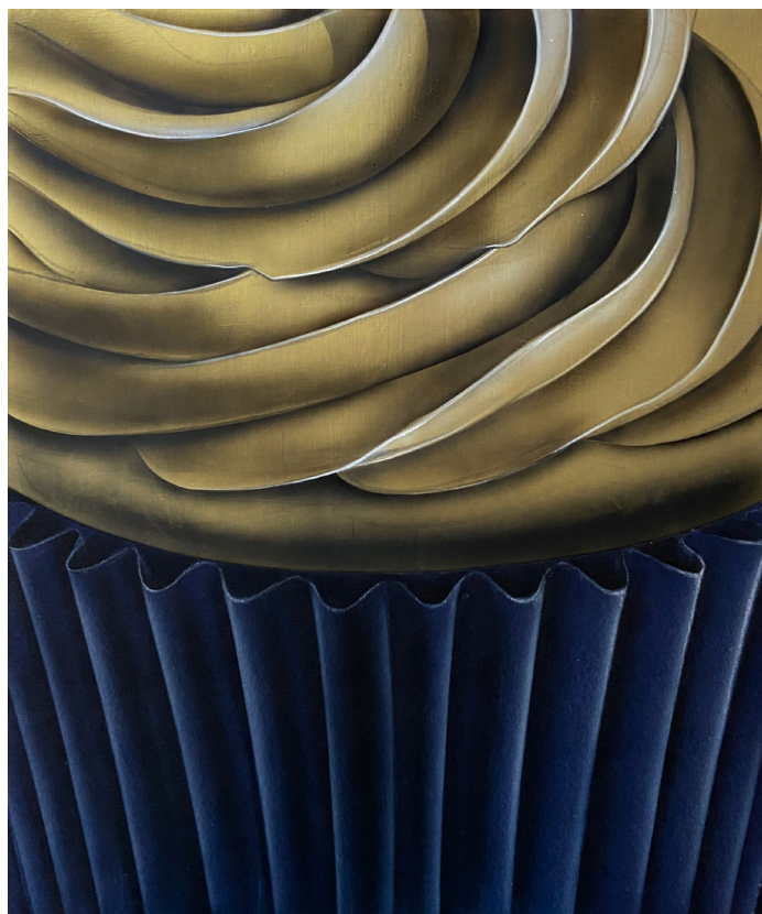
零光片羽 NO.2, 2024 布面丙烯、毛毡拼贴 60 x 50 cm