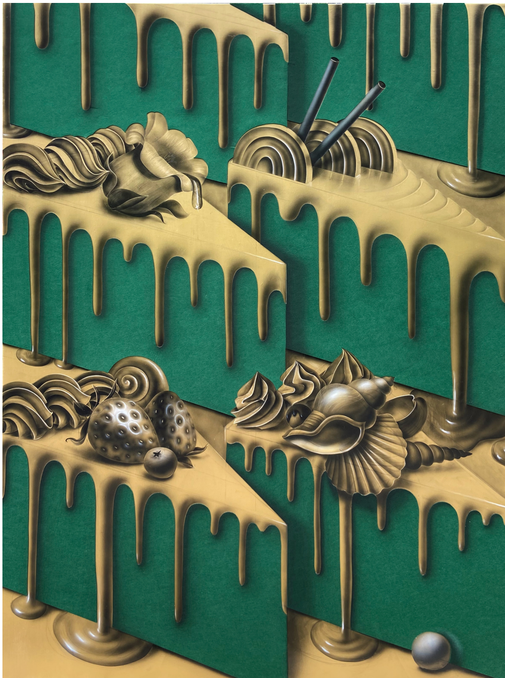
热带雨林, 2024 布面丙烯、毛毡拼贴 200 x 150 cm