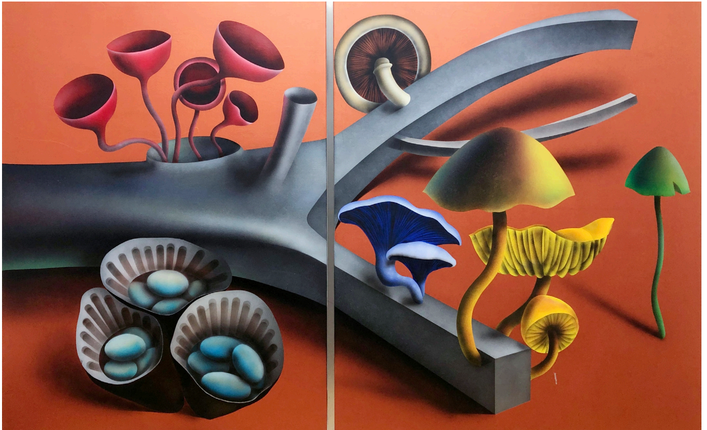
冰冷的，璀璨的，生长的，2023 布面丙烯 120 x 190 cm