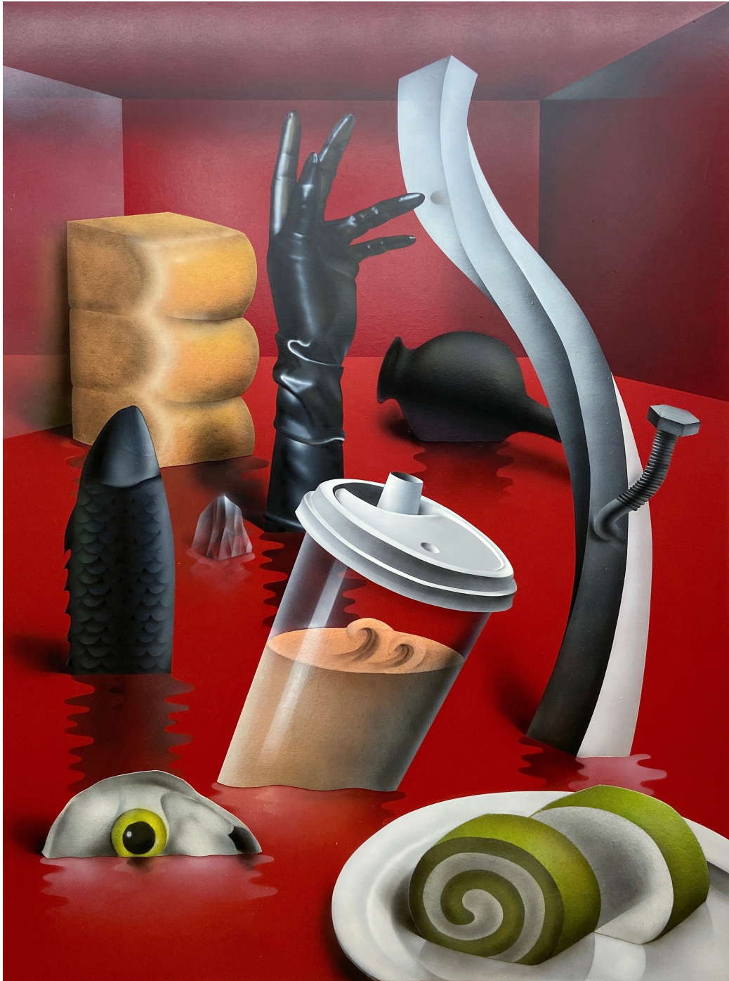
漂浮的，混沌的，2023 布面丙烯、织布 200 x 150 cm