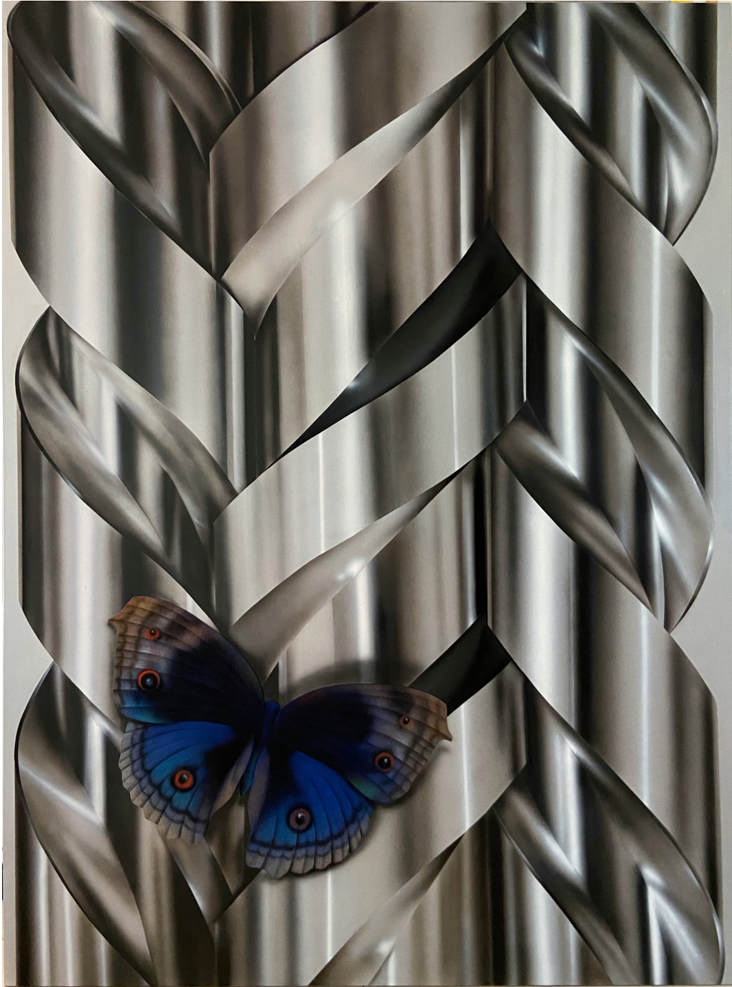
吞噬, 2024 布面丙烯、毛毡拼贴 200 x 150 cm