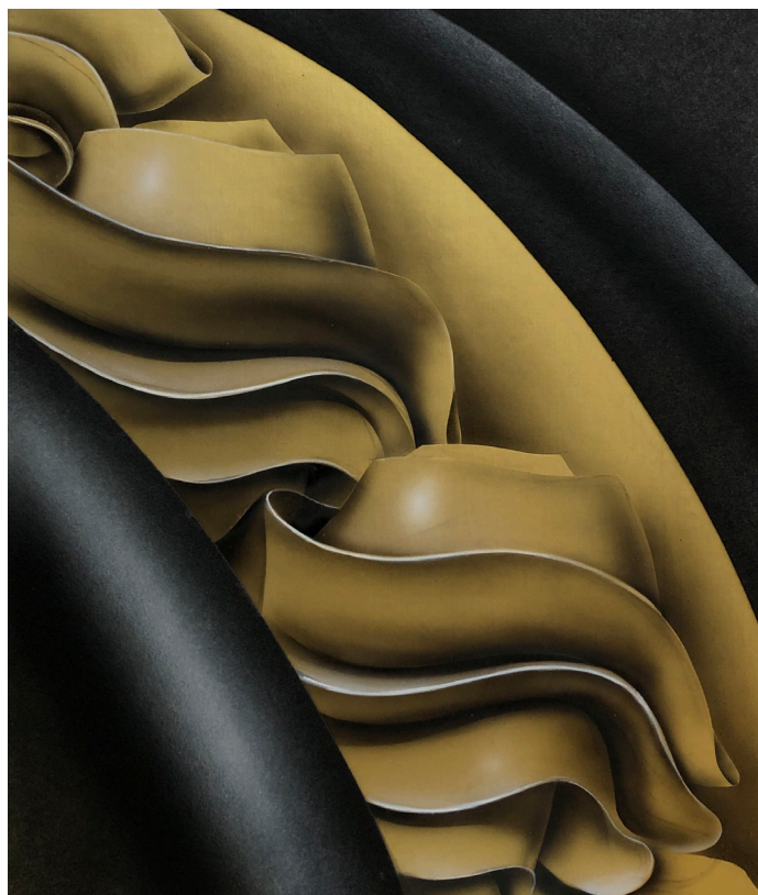
零光片羽 NO.1, 2024 布面丙烯、毛毡拼贴 60 x 50 cm