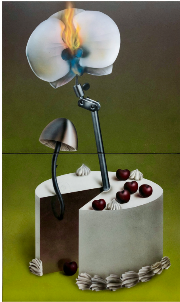
甜蜜的火焰, 2023 布面丙烯 100 x 60 cm