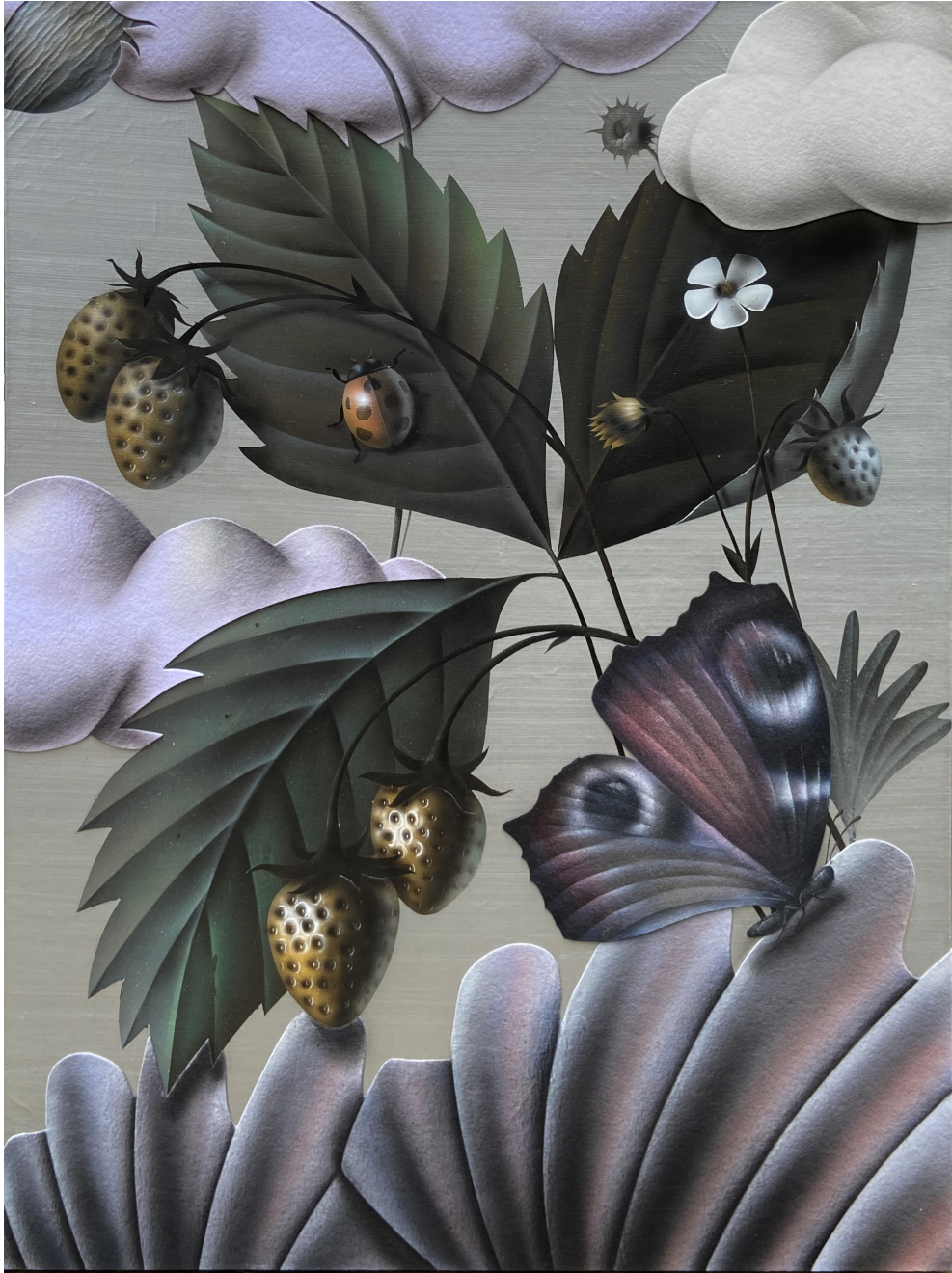
果实, 2024 布面丙烯、毛毡拼贴 120 x 90 cm