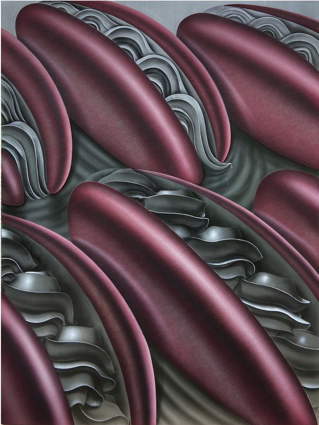
秩序的漪涟 NO.3, 2024 布面丙烯、毛毡拼贴 200 x 150 cm