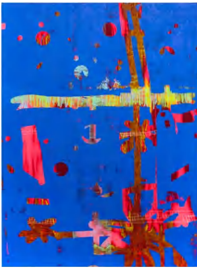
Pauline d'Andigné, Pink Elements on Blue , 2024