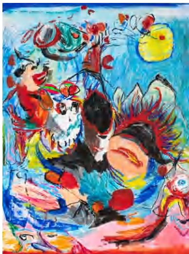
申翡娥, 梦幻之夜, 2023