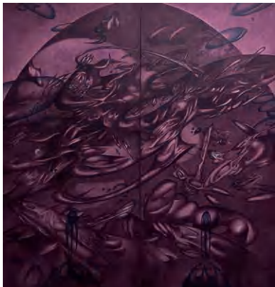
Erica Hsu, Thinking About Falling While Soaring , 2024