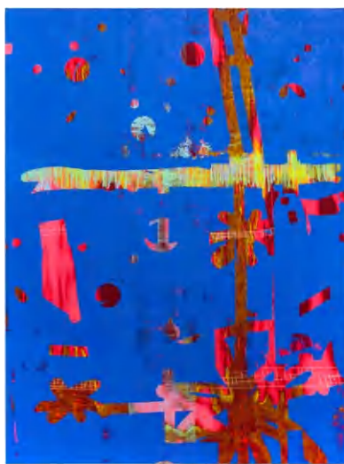
宝琳·丹迪涅, 蓝色上的粉色, 2024

当代青年艺术家们正在通过自己的方式进一步探索艺术的可能性。他们的创作语言形成了一道在途的、延续的线，贯穿于宗教文学、材料媒介、及世俗化的生命经验之间。对于观者而言，这条线索穿过静态的作品，并逐渐延伸为一种有机的动态互动。这种“后置”的生命力使艺术被不断重新解读和被赋予新意义，最终形成一种基于个人经验的再发现和再创造。