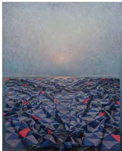
张凌瑞, 视角练习 - 05, 2024

HdM 画廊欣然宣布将于 2024 年 7 月 13 日举办群展“在途”，本次展览以“在途”这个具有延续性的动词作为切入点，从艺术创作的文本性、技术性 & 主观性 (Textuality, Technique, and Subjectivity) 三个方面出发，聚焦于中西方青年艺术家的创作语言和提喻表达。展览将呈现来自中国、法国、美国、韩国、格鲁吉亚等多个不同国家共 11 位艺术家的代表作品。展览将持续至 9 月 7 日。