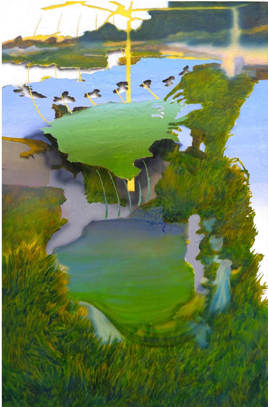
绿色的云和地上的云 Green clouds and clouds on the ground