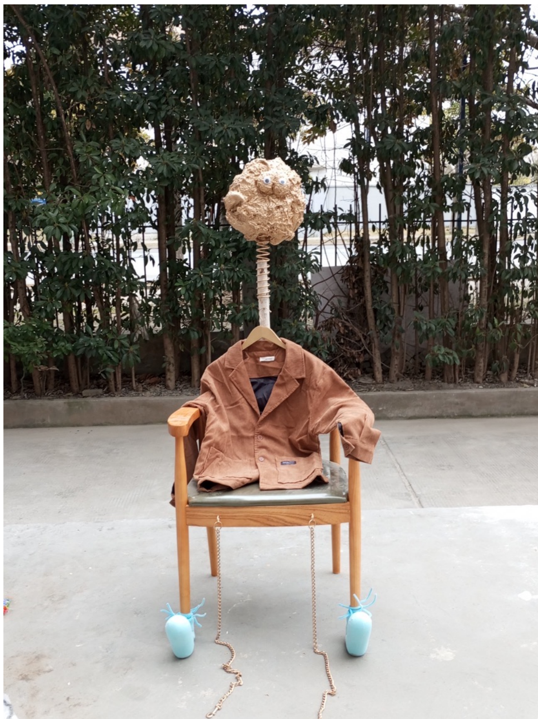
跷脚 Cross-Legged 场域特定装置Installation 尺寸可变 2024